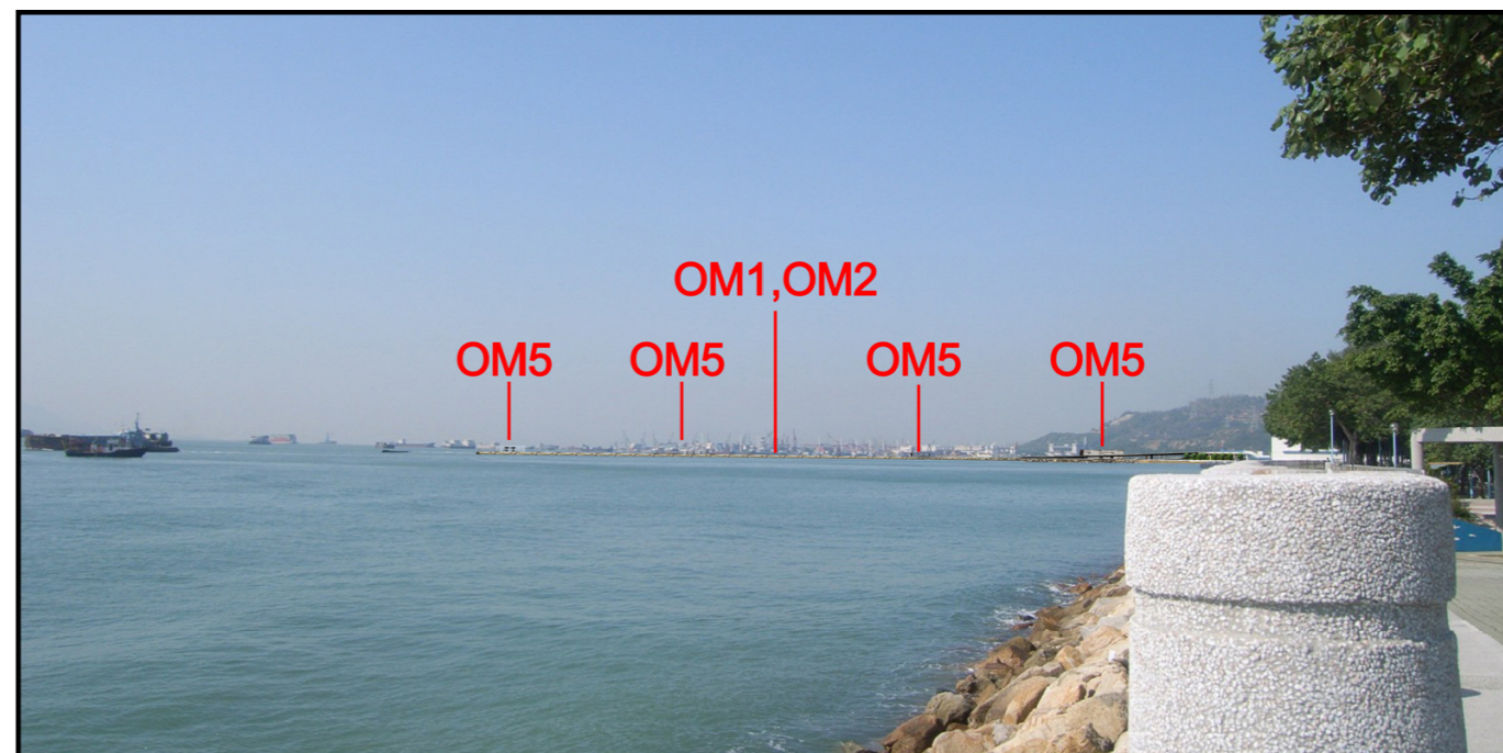
10 YEARS WITH MITIGATION MEASURES

Plotting By: IDATES PLOT SCALE: ESCALESHORTS