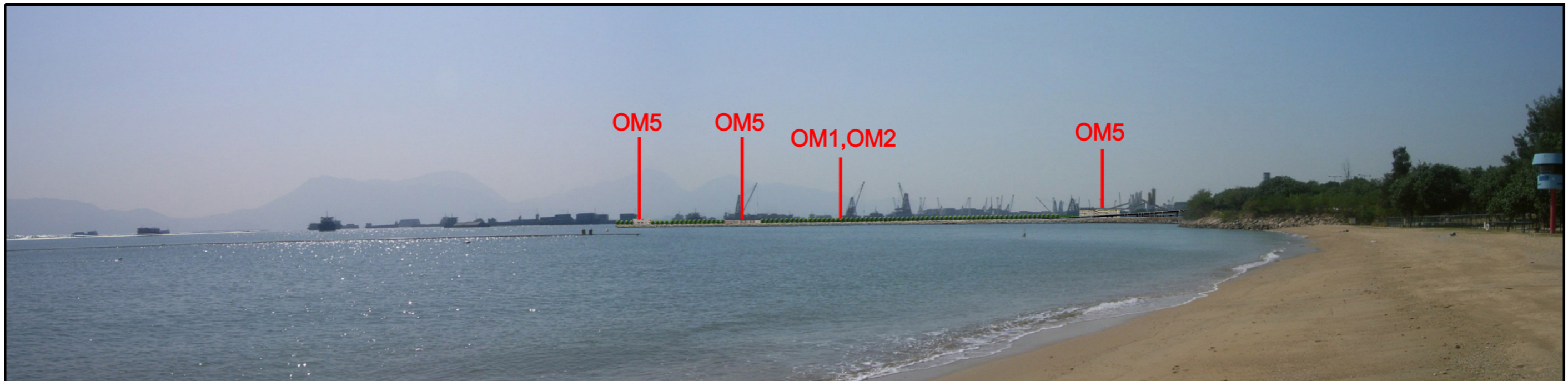
10 YEARS WITH MITIGATION MEASURES

Plotting By: IDATES PLOT SCALE: ESCALESHORTS