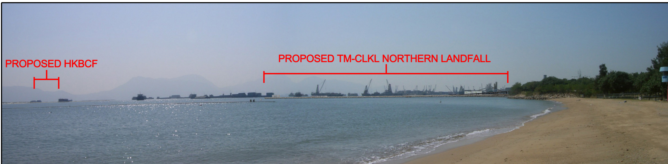
DAY 1 WITHOUT MITIGATION MEASURES