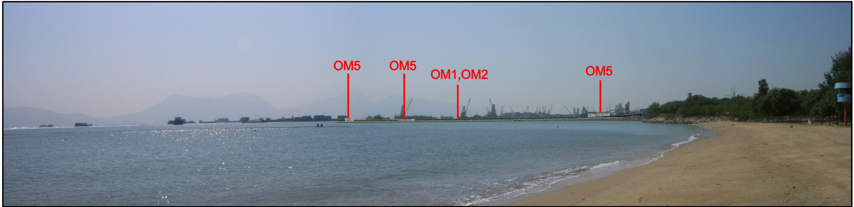
DAY 1 WITH MITIGATION MEASURES