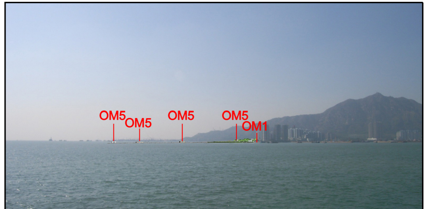
10 YEARS WITH MITIGATION MEASURES

Plotting By: IDATES PLOT SCALE: ESCALESHORTS