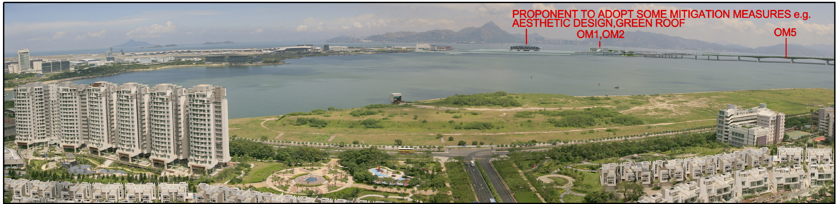
10 YEARS WITH MITIGATION MEASURES

Plotting By: DATES PLOT SCALE: ESCALES: SHORTS