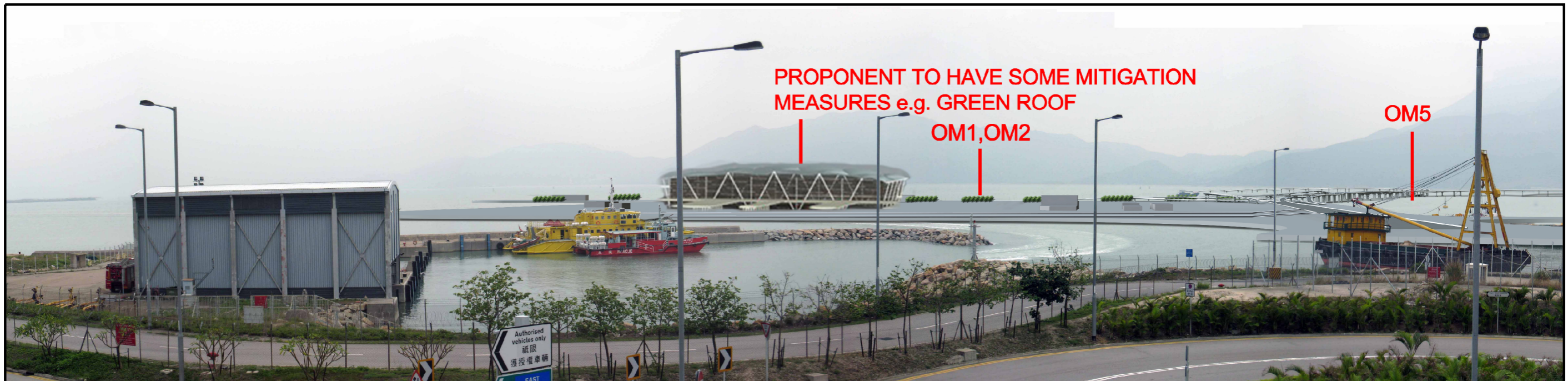
10 YEARS WITH MITIGATION MEASURES

Polling By: IDATES PLOT SCALE: ESCALESHORTS