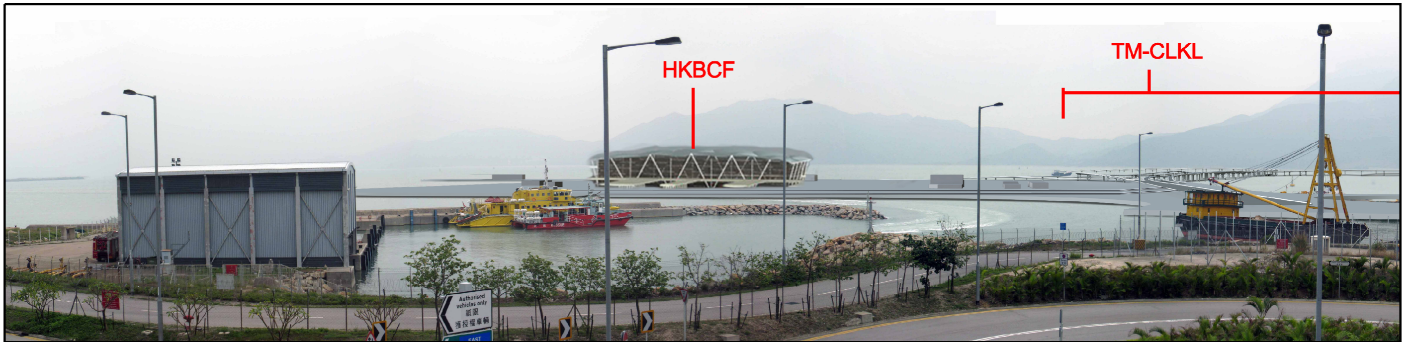
DAY 1 WITHOUT MITIGATION MEASURES

Plotting By: IDATES PLOT SCALE: ESCALESHORTS