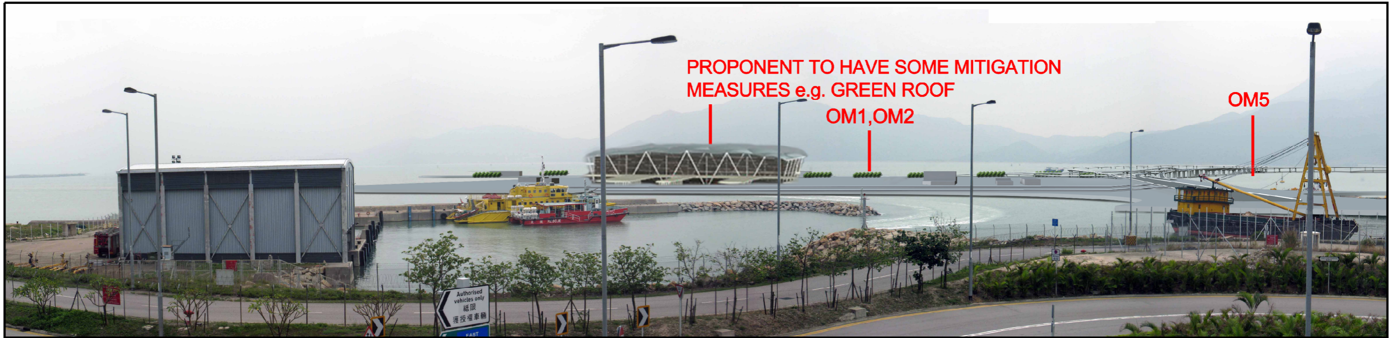
DAY 1 WITH MITIGATION MEASURES