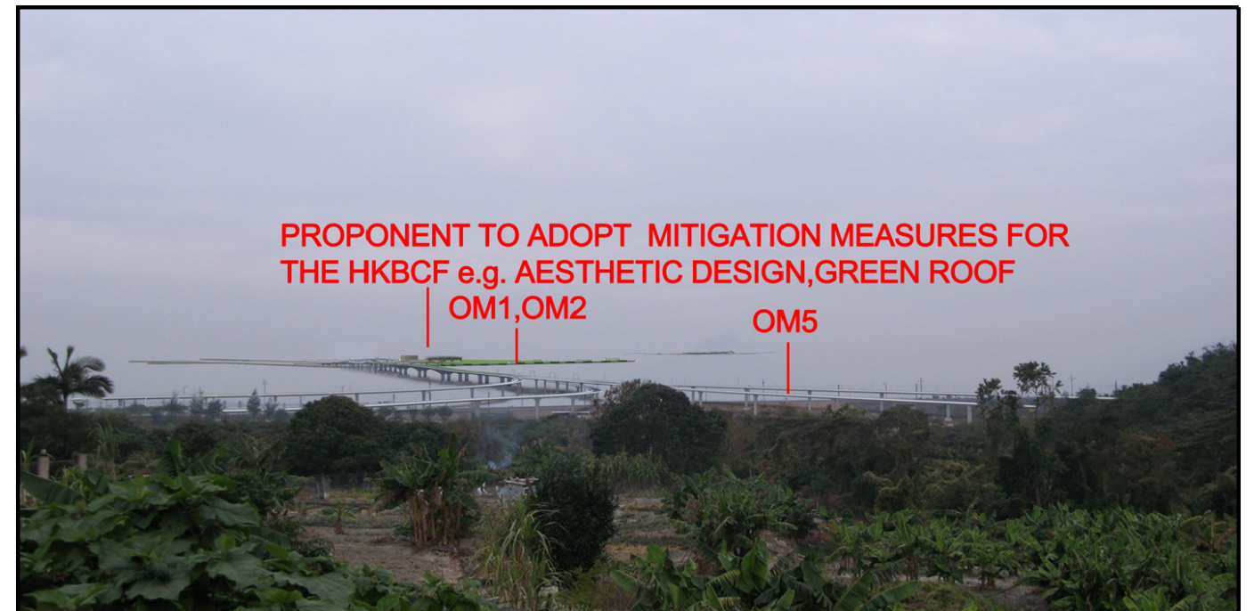
10 YEARS WITH MITIGATION MEASURES

Plotting By: IDATES PLOT SCALE: ESCALESHORTS