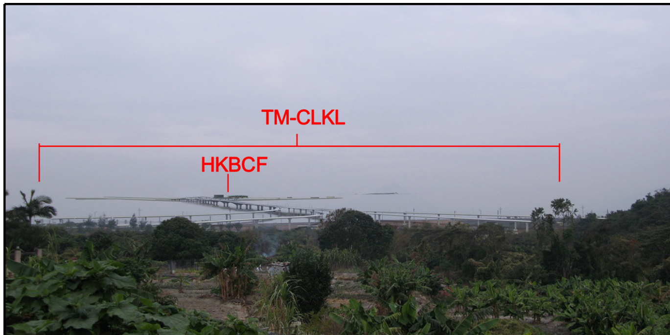
DAY 1 WITHOUT MITIGATION MEASURES