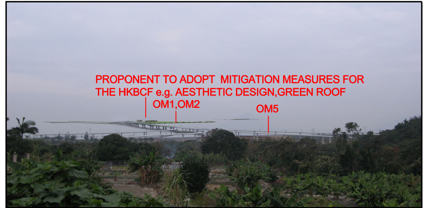
DAY 1 WITH MITIGATION MEASURES