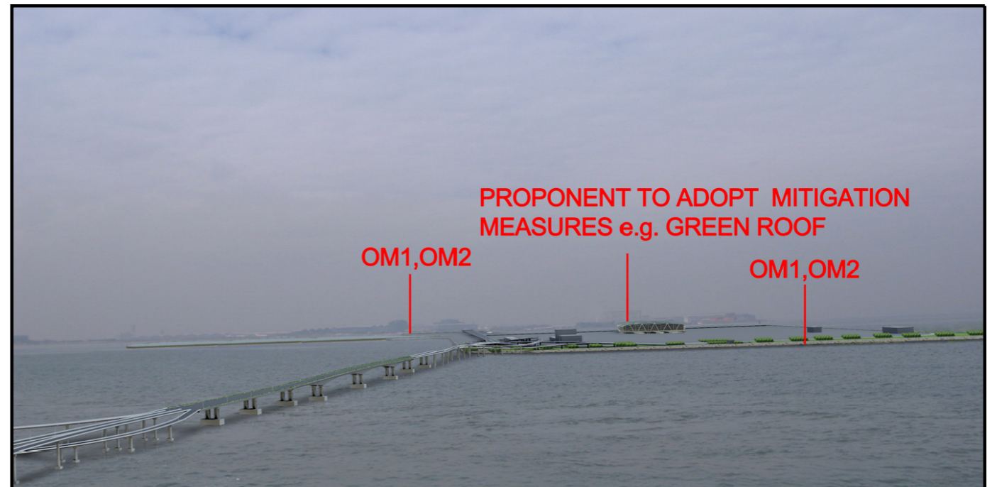
10 YEARS WITH MITIGATION MEASURES

Plotting By: IDATES PLOT SCALE: SCALES/SHORTS