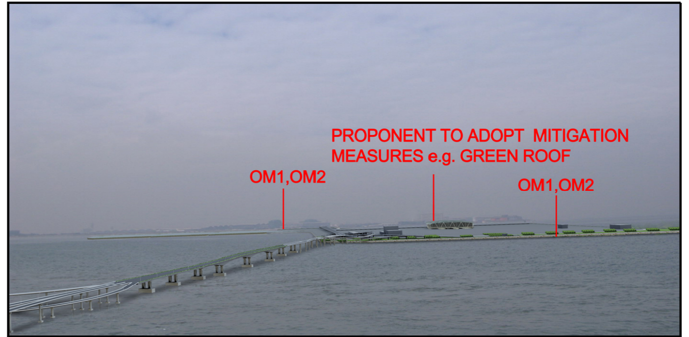
DAY 1 WITH MITIGATION MEASURES