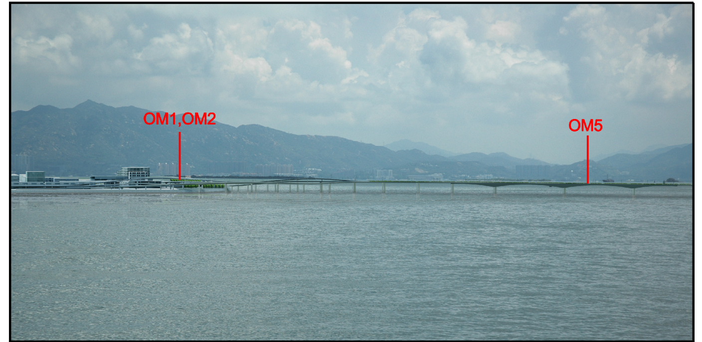
DAY 1 WITH MITIGATION MEASURES