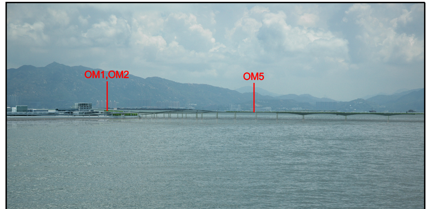
10 YEARS WITH MITIGATION MEASURES

Plotting By: IDATES PLOT SCALE: ESCALESHORTS