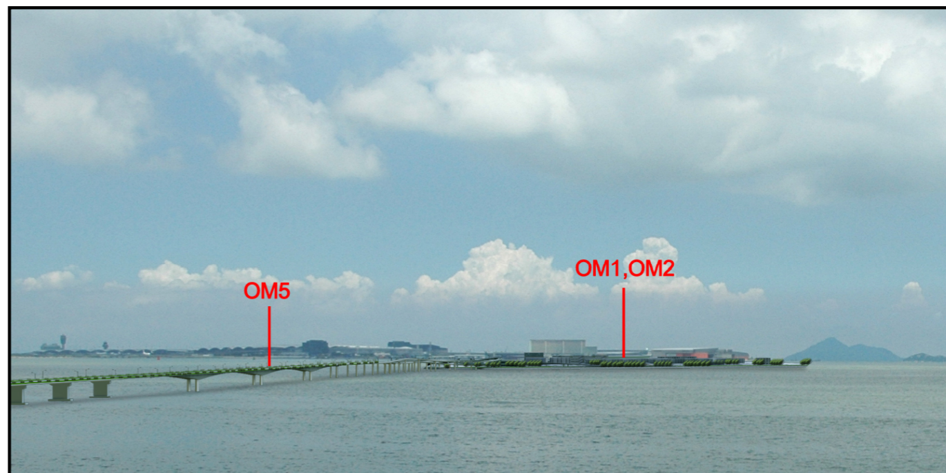
10 YEARS WITH MITIGATION MEASURES

Plotting By: IDATES PLOT SCALE: ESCALESHORTS