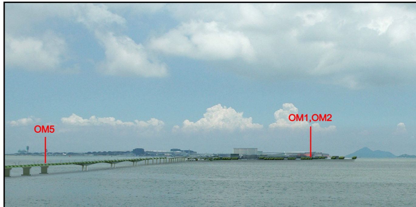
DAY 1 WITH MITIGATION MEASURES