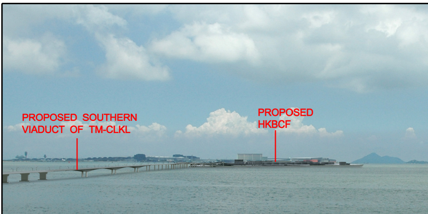
DAY 1 WITHOUT MITIGATION MEASURES