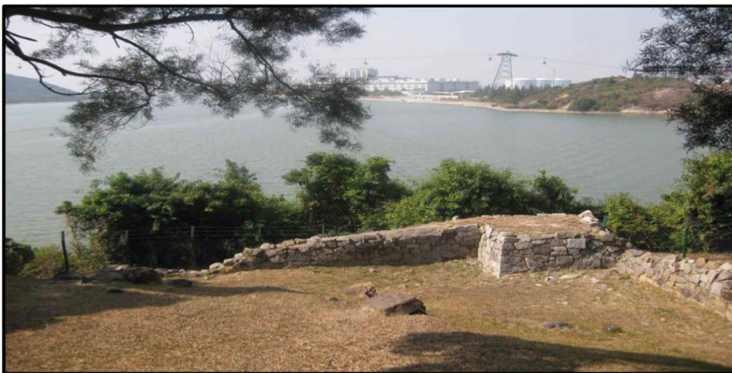
PLATE 3: TUNG CHUNG BATTERY