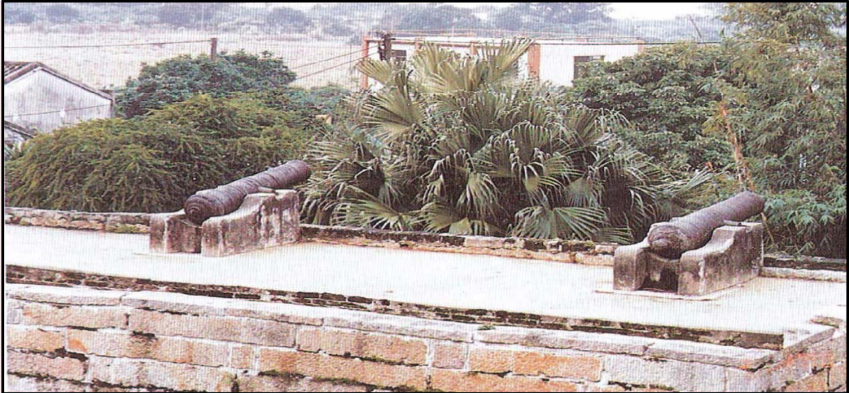
PLATE 1: CANNON ON THE MAIN WALL OF THE TUNG CHUNG WALLED CITY