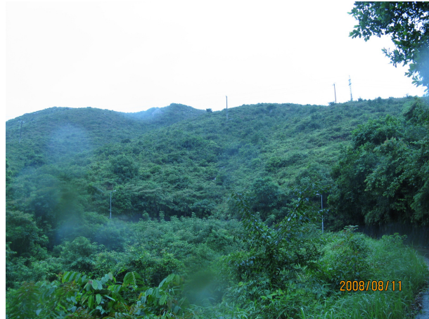
Secondary Woodland Habitat