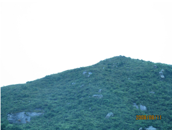
Tall Shrubland Habitat