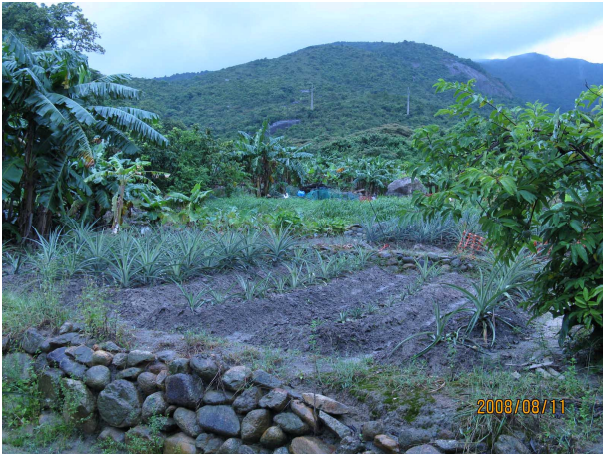
Cultivated Land Habitat