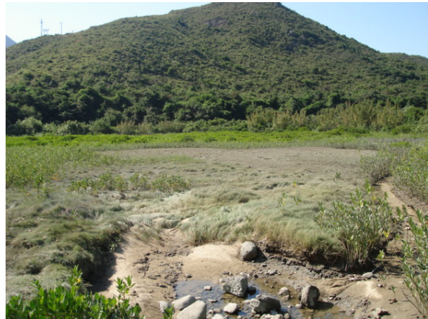
Salt Marsh Habitat

Photographs of Habitats Present within the Study Area