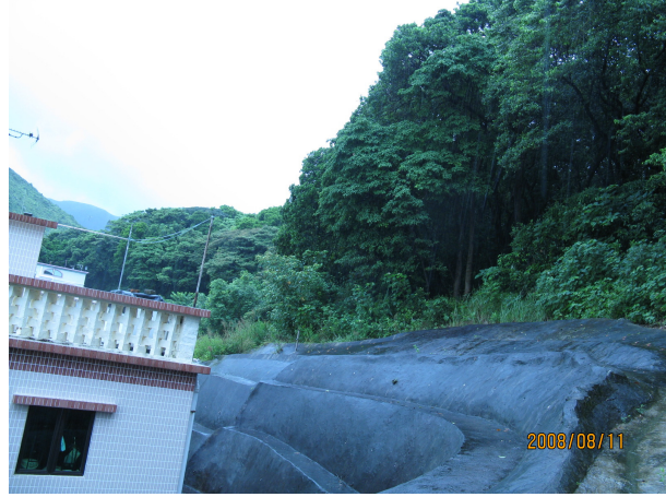
Plantation Woodland Habitat