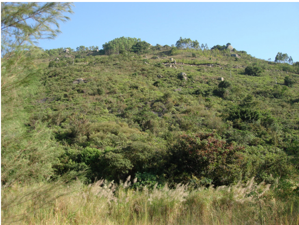
Shrubby Grassland Habitat