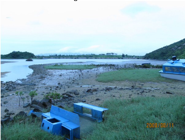
Mud Flat Habitat