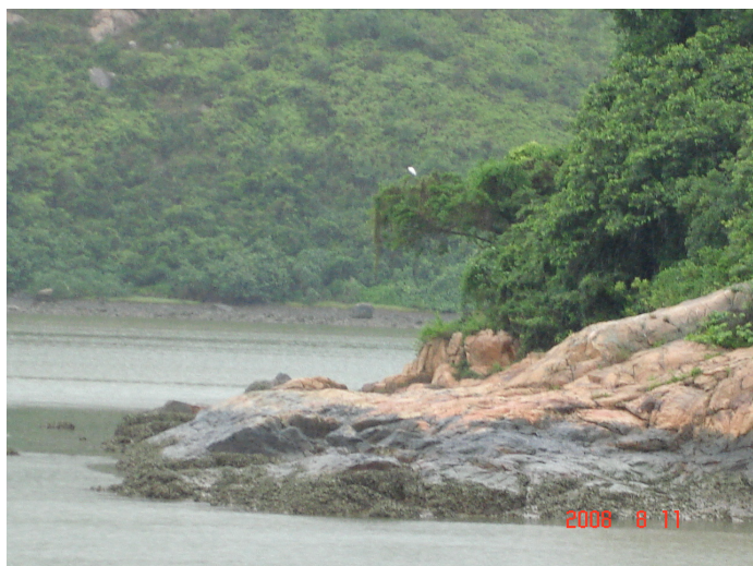
Natural Hard Shore