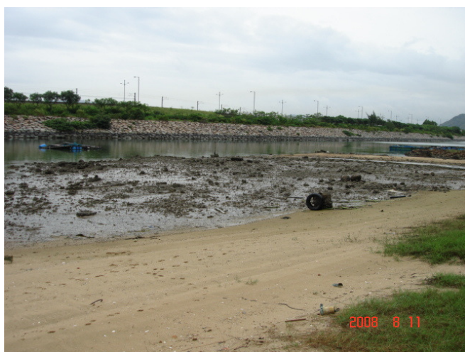
Sandy Natural Shore

Photographs of Habitats and Species of Conservation Interest Present in the Wider Study Area