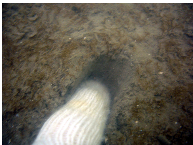
Soft Substrate Benthic Habitat