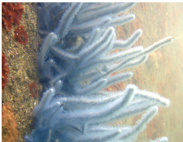
Octocoral ( Guaiagorgia sp.)