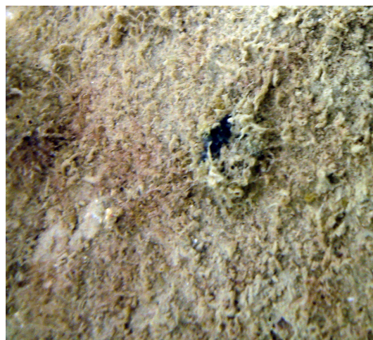
Hard Substrate Benthic Habitat

Photographs of Habitats and Species of Conservation Interest Present in the Wider Study Area