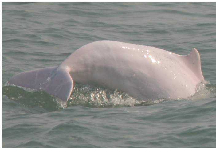
Chinese White Dolphin and Marine Water