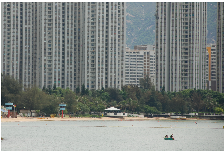
Gazetted Sandy Beach (Butterfly Beach)