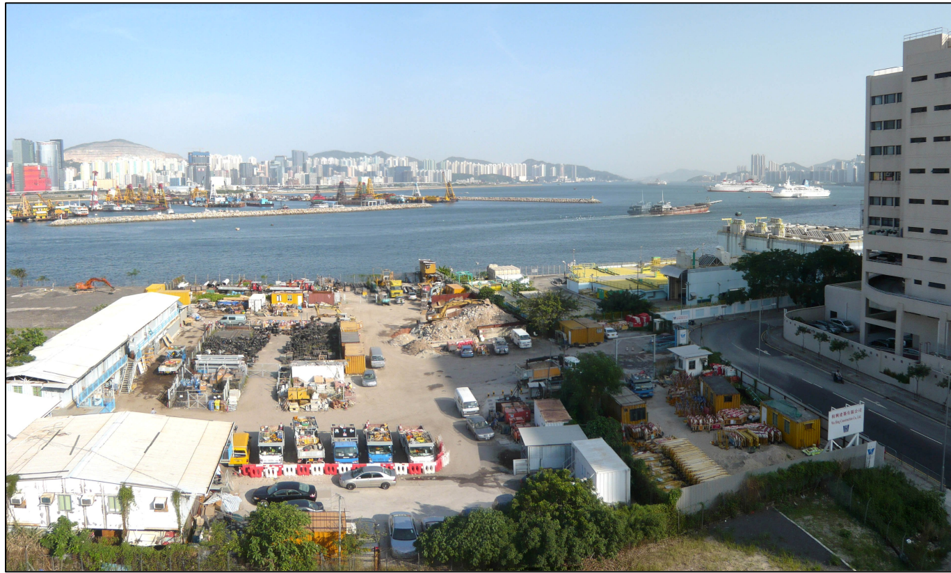
Existing View from West – Po Leung Kuk Ngan Po Ling College