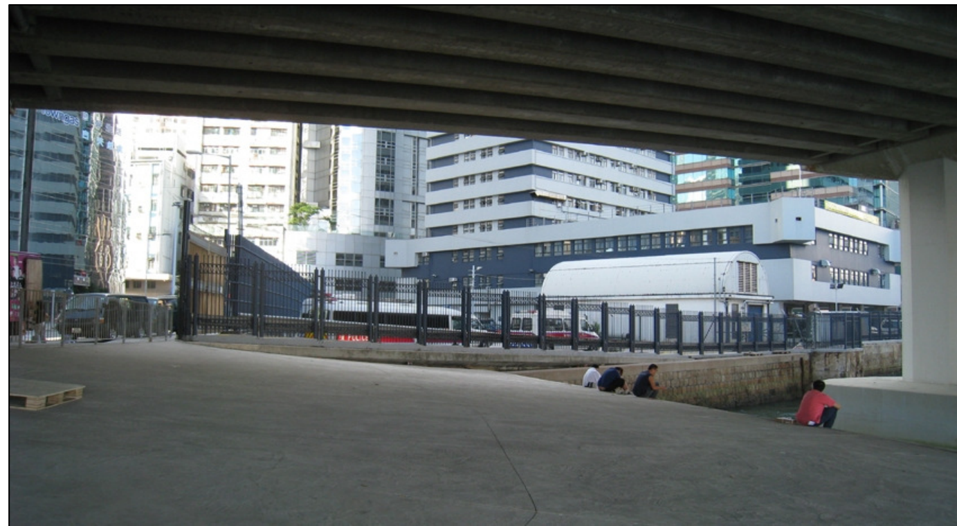
Existing View from Northeast – future Promenade