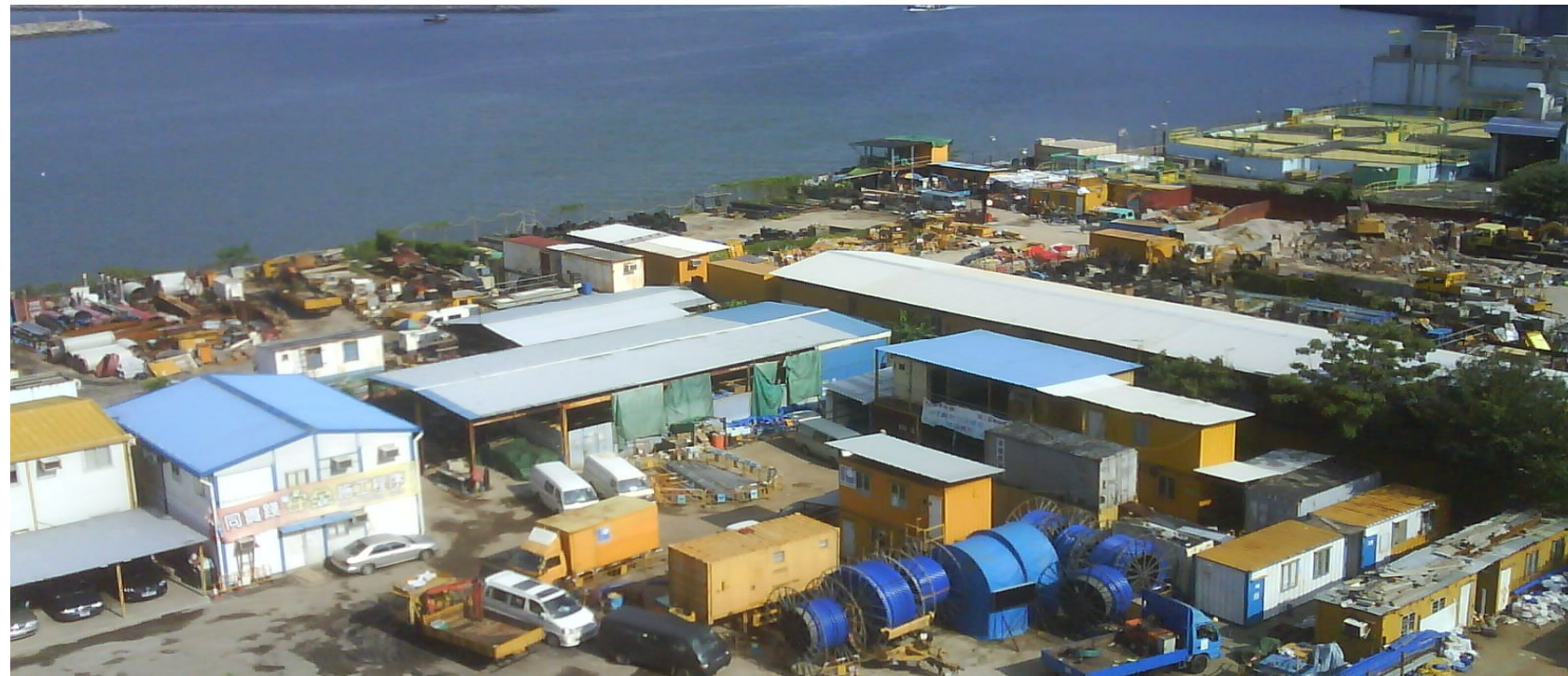
LCA1 To Kwa Wan Plain