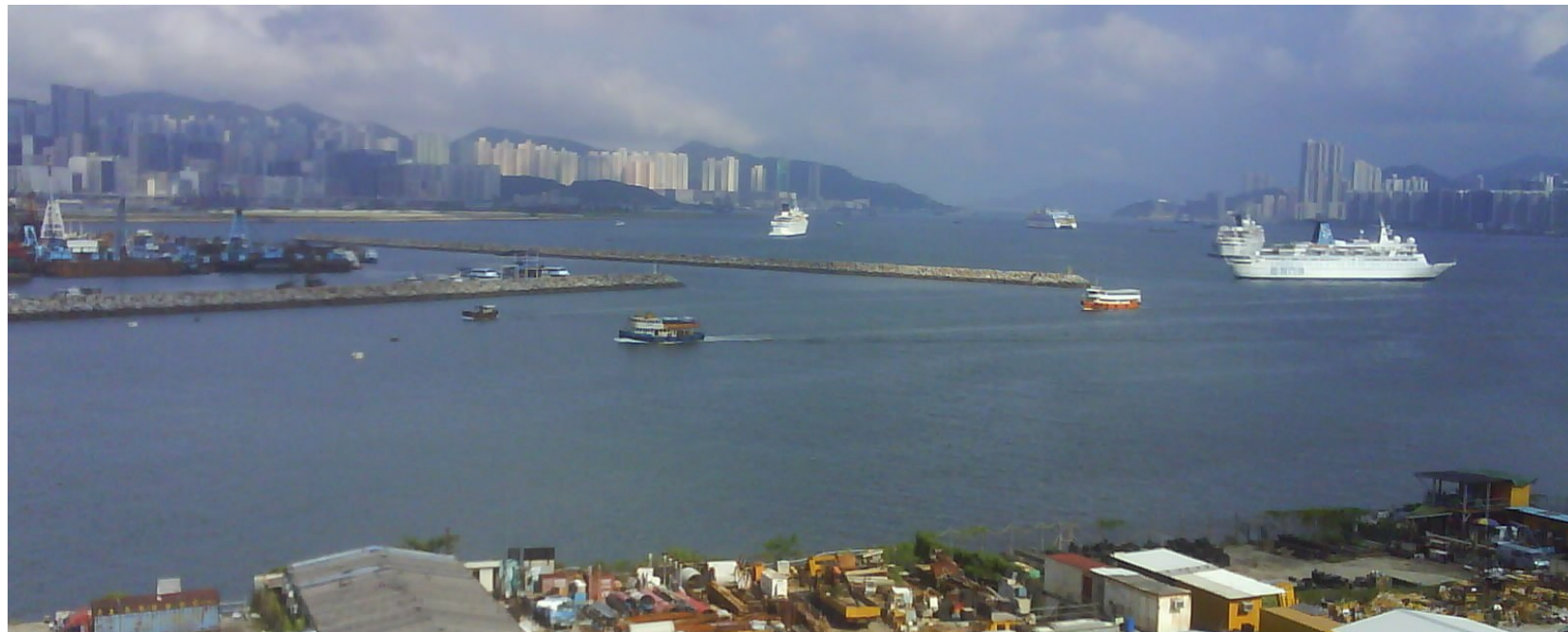
LCA2 To Kwa Wan Waterfront Area