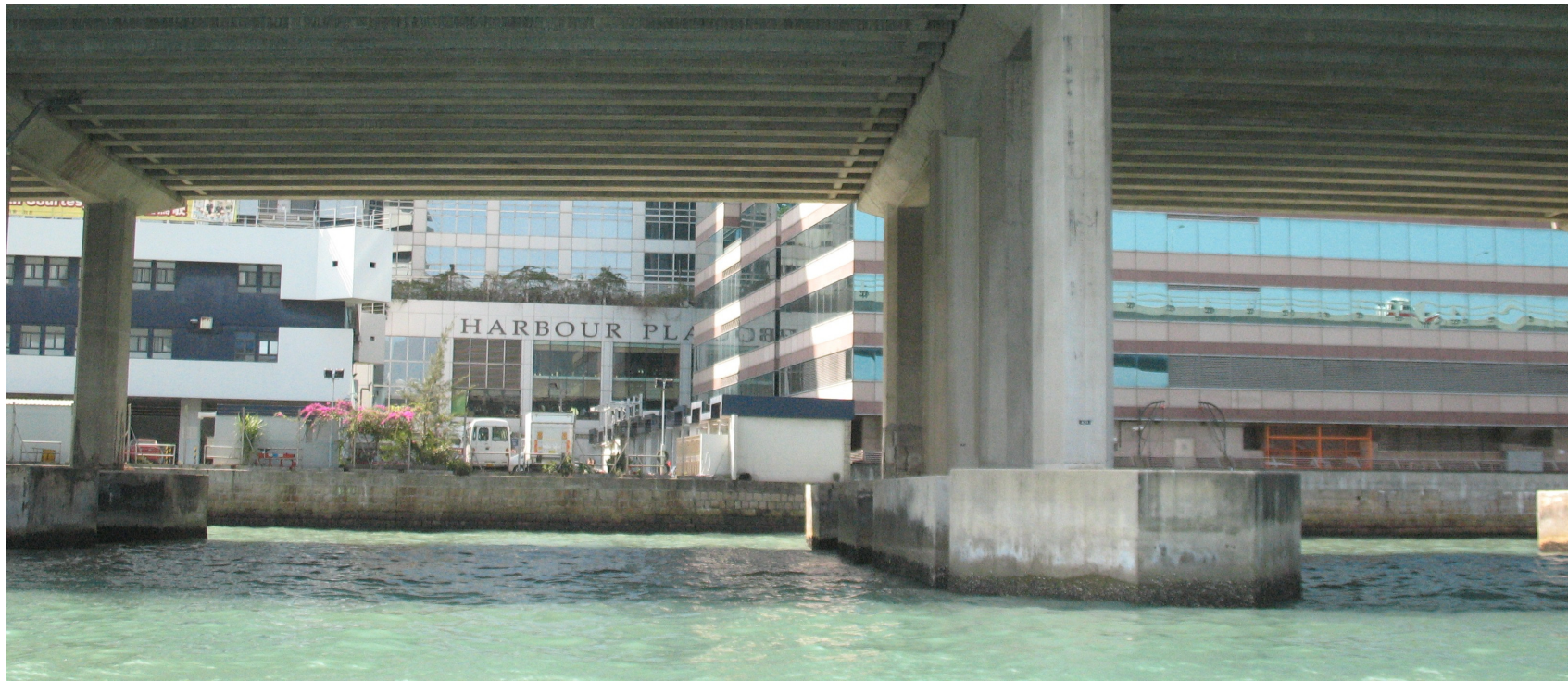
LCA3 North Point Waterfront Area