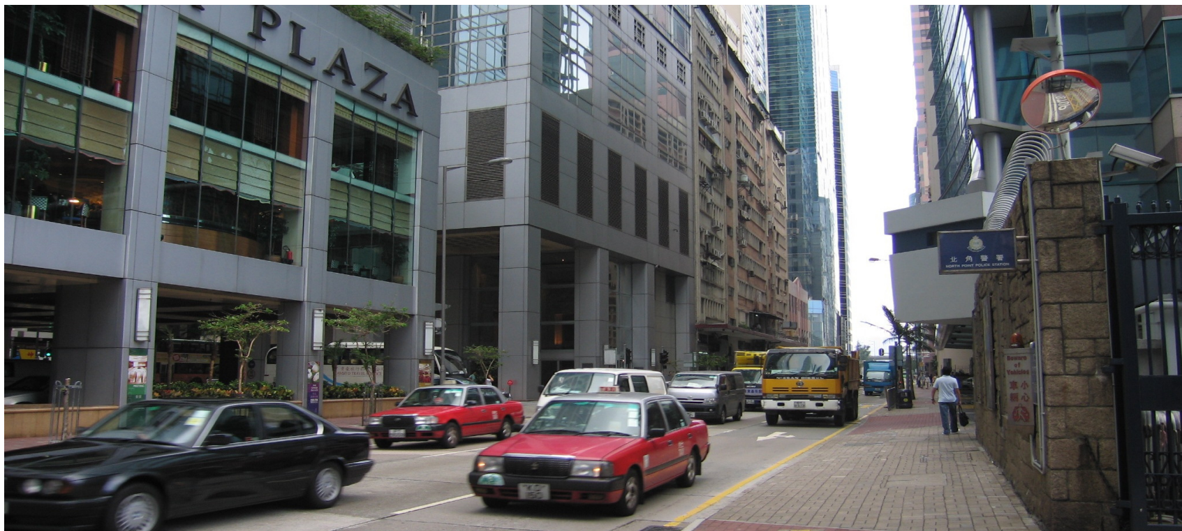
LCA4 North Point Urban Group