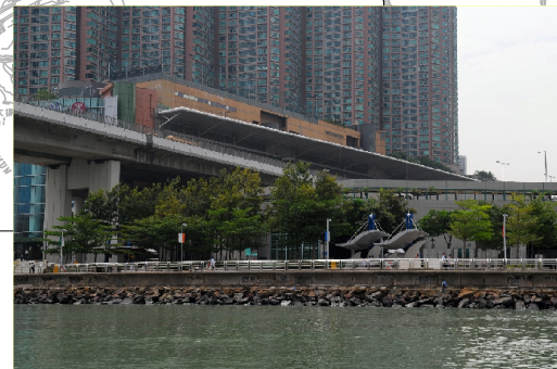
ARTIFICIAL BOULDER ALONG THE SHORE OF TSING YI