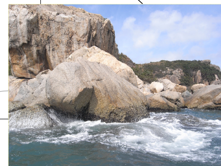
ROCKY SHORE AT KAU YI CHAU