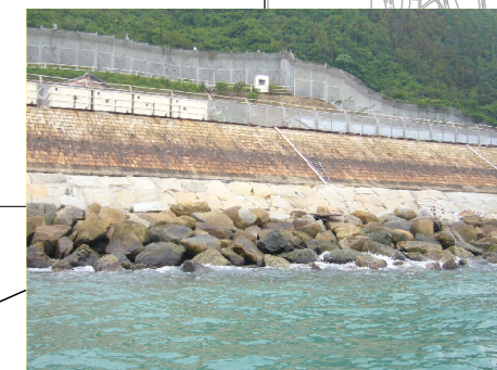
ARTIFICIAL BOULDER AT GREEN ISLAND