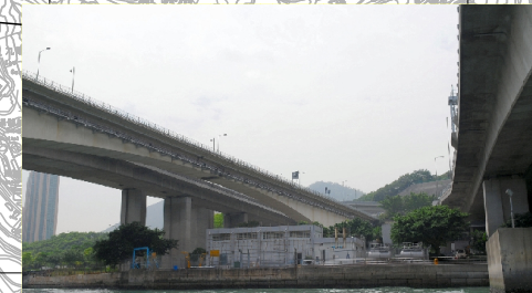
VERTICAL SEAWALL ALONG THE SHORE OF KWAI CHUNG