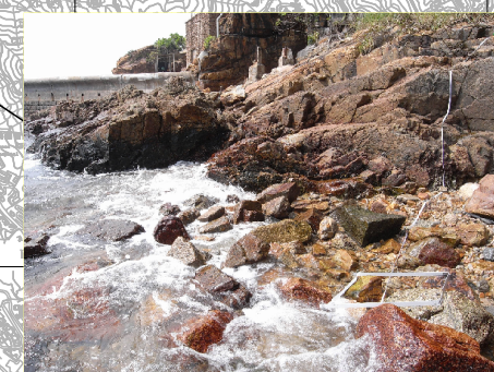
ROCKY SHORE AT GREEN ISLAND