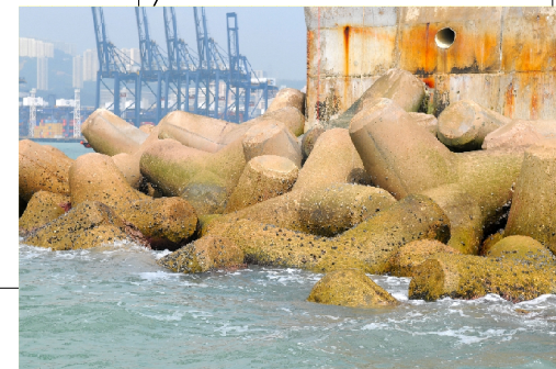
DOLOSSE UNDER STONECUTTERS BRIDGE