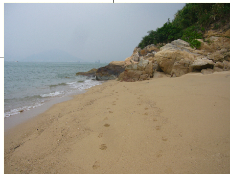
SANDY SHORE AT KAU YI CHAU