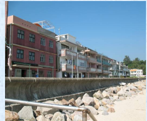
VSR10 – Peng Chau