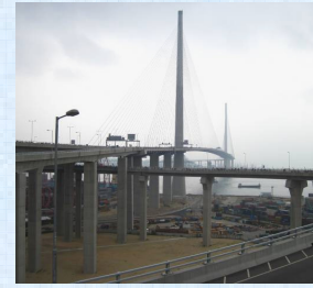
VSR4 – Route 8