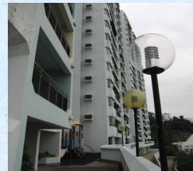
VSR8 – Pok Fu Lam