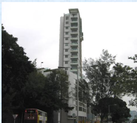
VSR7 – Victoria Road