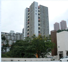
VSR1 – Ha Kwai Chung Residential Area