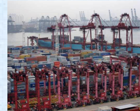
VSR14 – Terminal 9