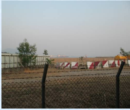
VSR12 – Disney Land