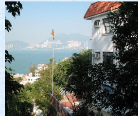
VSR9 – North Lamma