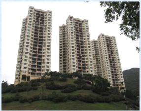
VSR11 – Discovery Bay