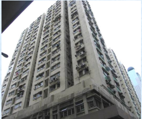
VSR6 – Kennedy Town