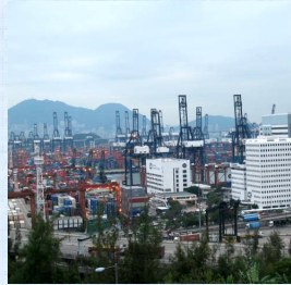
VSR2 – Kwai Chung Container Terminals