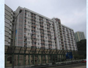
VSR15 – Tsing Yi Residential Area