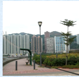
VSR3 – Tsuen Wan Urban Fringe