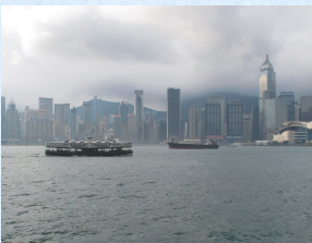
VSR16 – Travellers across the Harbour