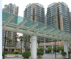
VSR13 – Ma Wan