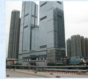
VSR5 – West Kowloon Urban Fringe