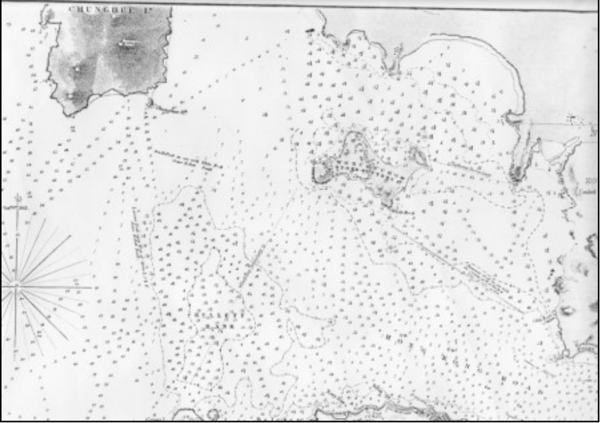
Figure 9.17: Navigation Chart 1888.