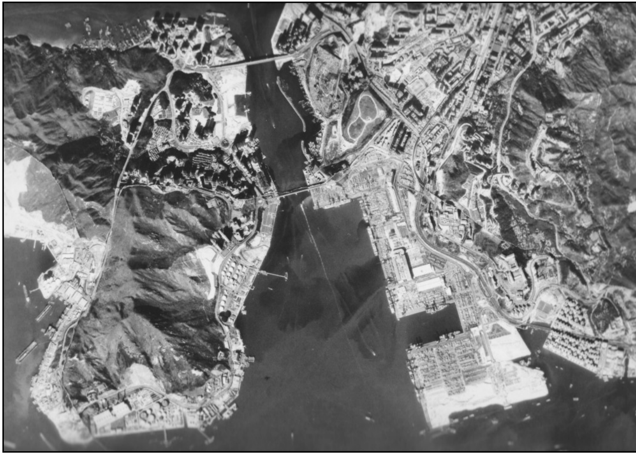
Figure 9.12: Aerial Photograph of the Study Area 1989.