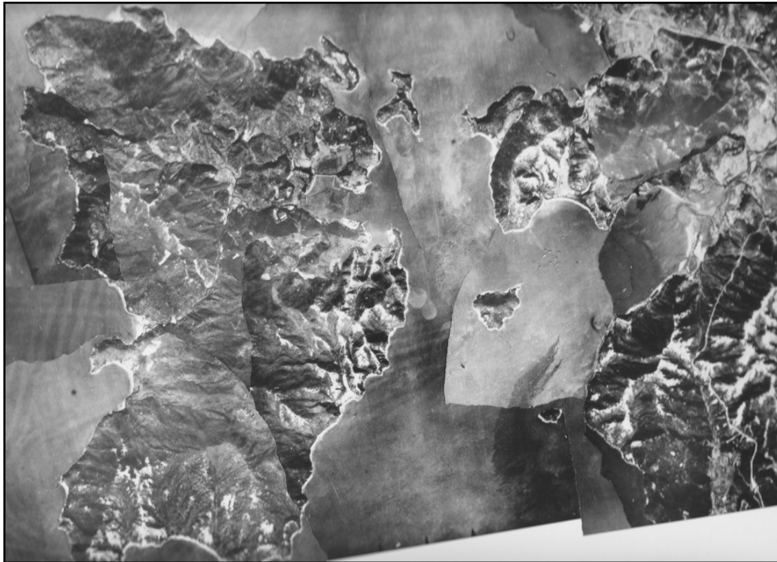
Figure 9.8: Aerial Photograph of the Study Area 1924.