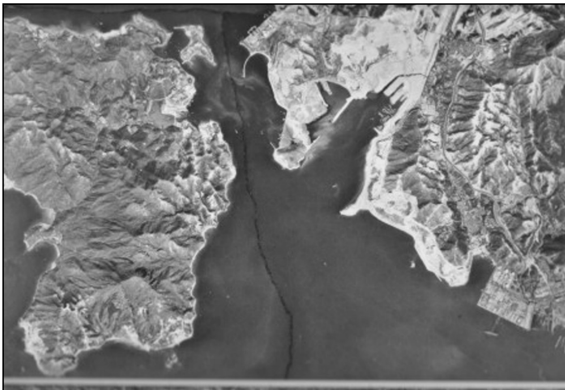
Figure 9.10: Aerial Photograph of the Study Area 1964.