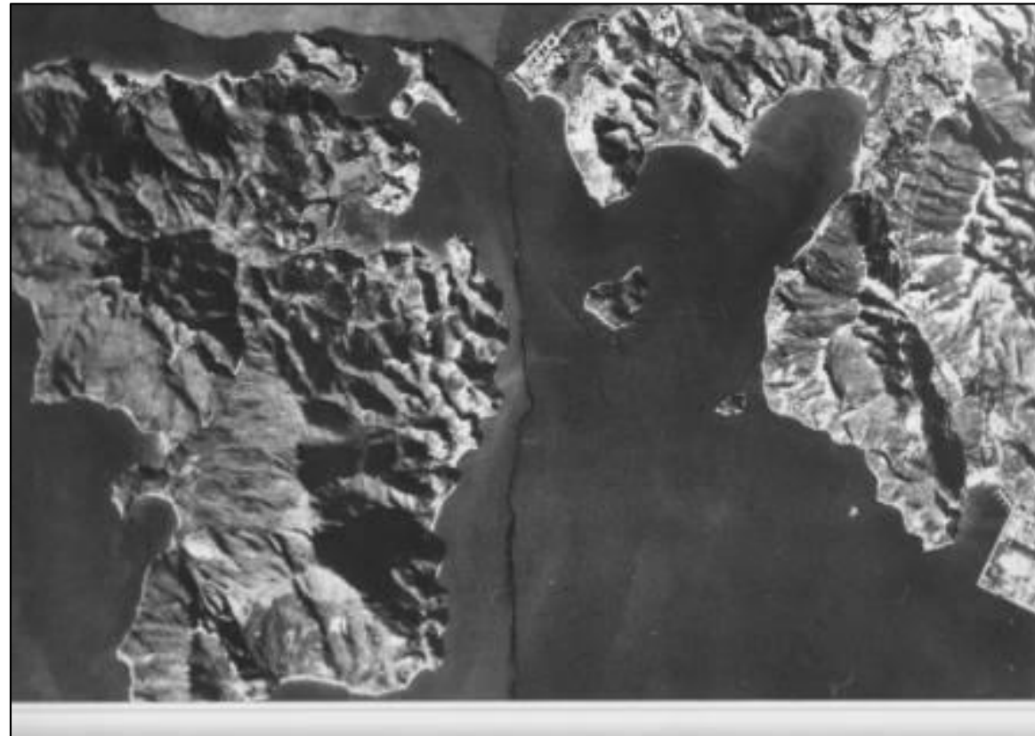
Figure 9.9: Aerial Photograph of the Study Area from 1954.