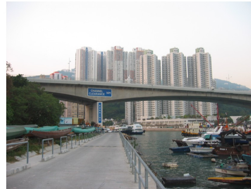
LCA 8 Aberdeen Waterfront Landscape