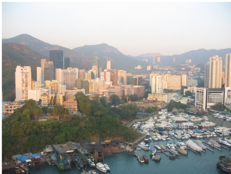
LCA 6 Wong Chuk Hang Industrial and Institutional Landscape