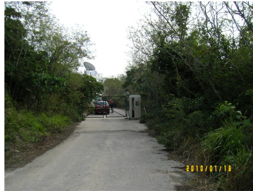
LCA 10 Chung Hom Kok Utilities Landscape