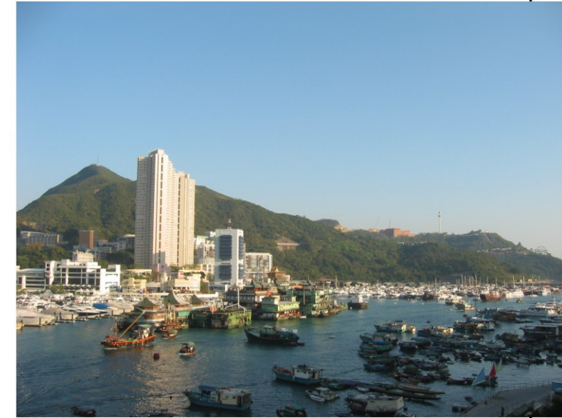
LCA 7 Nam Long Shan Maritime and Recreational Landscape