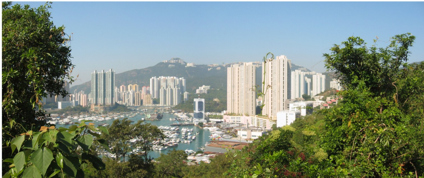
LCA 8 Aberdeen Waterfront Landscape