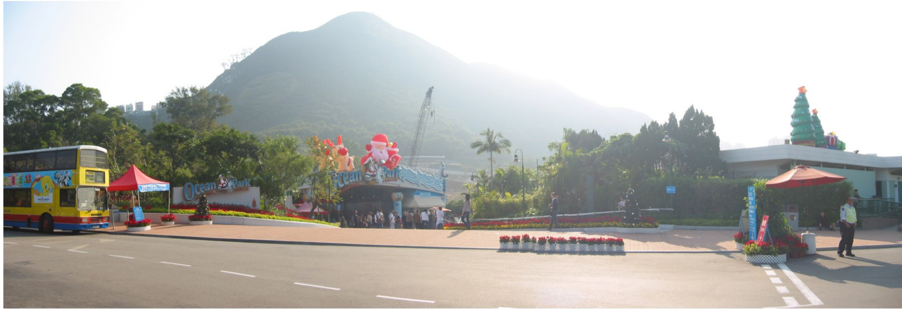
LCA 7 Nam Long Shan Maritime and Recreational Landscape