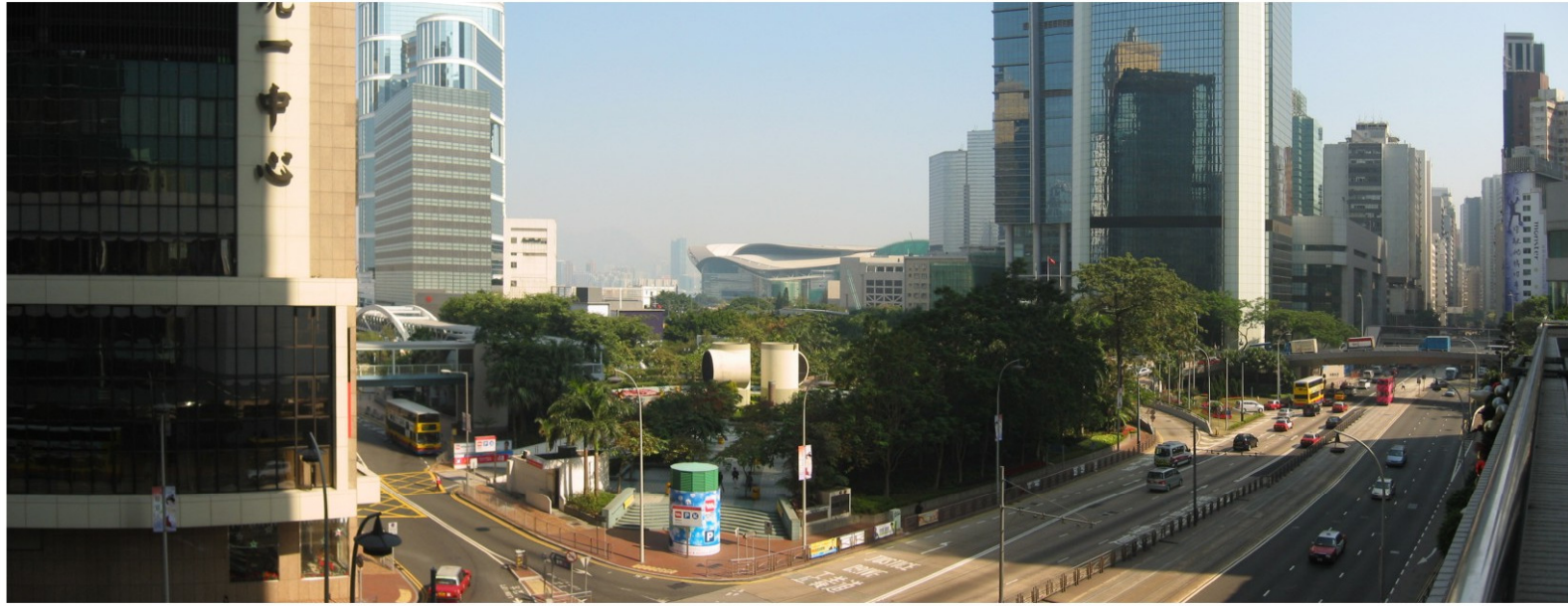
LCA1 Admiralty Commercial Landscape