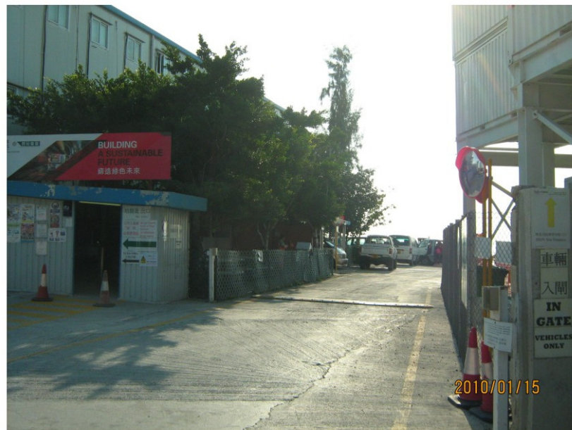
LCA 11 Telegraph Bay Institutional Landscape