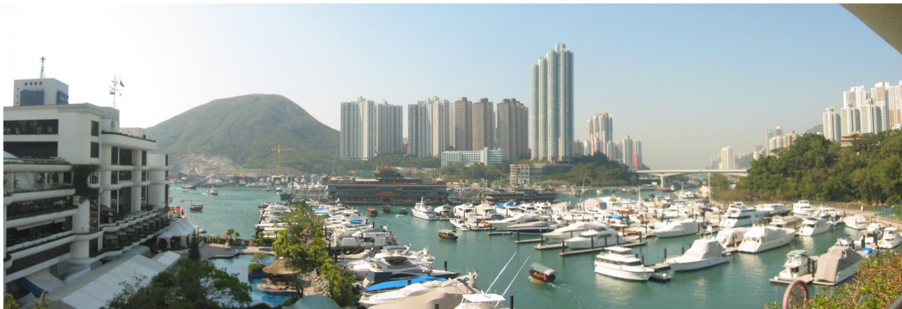
LCA 9 Ap Lei Chau Island Landscape