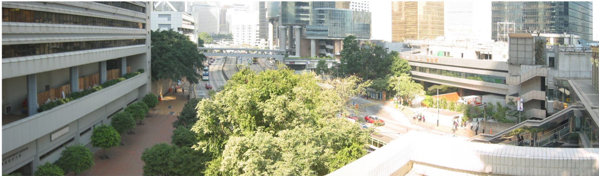
LCA1 Admiralty Commercial Landscape