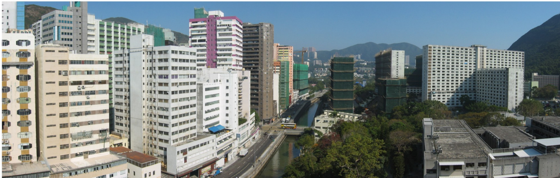
LCA 6 Wong Chuk Hang Industrial and Institutional Landscape