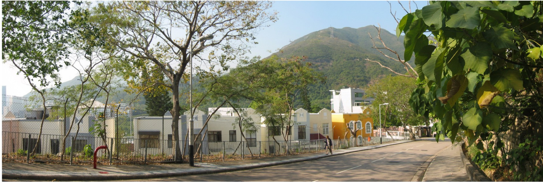
LCA 5 Shouson Hill Low-rise Residential Landscape