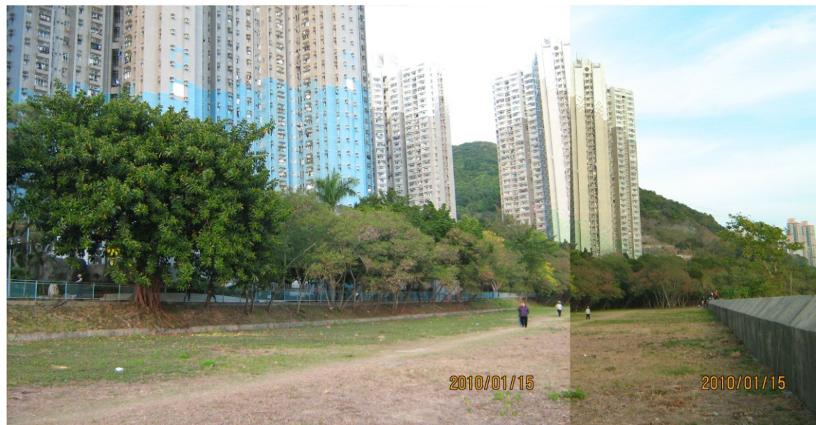
LCA 12 Wah Kwai Utilities Landscape