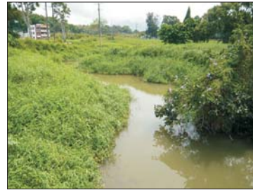
LR1.2 CHANNELIZED WATERCOURSE