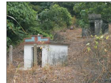
LR6.9 TEMPLE AREA