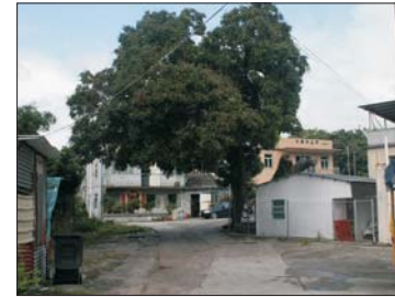
LR6.3 TRADITIONAL VILLAGE AREA