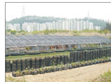
LR5.2 INACTIVE FARMLAND