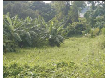
LR3.1 WOODLAND ON HILLSIDE