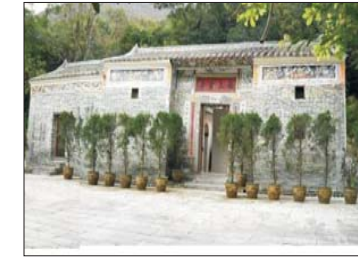
LR6.9 TEMPLE AREA