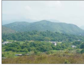
LR3.1 WOODLAND ON HILLSIDE