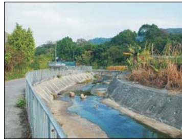
LR1.2 CHANNELIZED WATERCOURSE