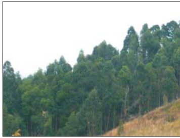
LR2.2 VEGETATED MAN-MADE SLOPE