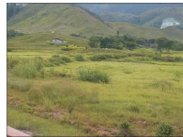
LR6.3 TRADITIONAL VILLAGE AREA