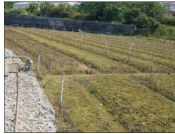
LR5.1 ACTIVE FARMLAND