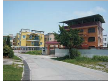
LR6.2 VILLAGE AREA