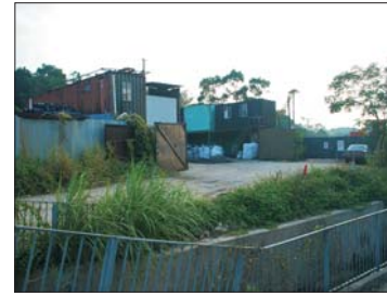
LR6.4 INDUSTRIAL/FACILITY AREA