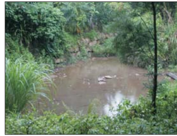
LR3.3 FUNG SHUI WOODLAND