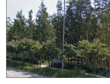
LR6.11 OPEN SPACE