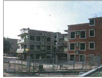
LR6.2 VILLAGE AREA