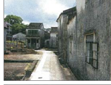
LR6.3 TRADITIONAL VILLAGE AREA