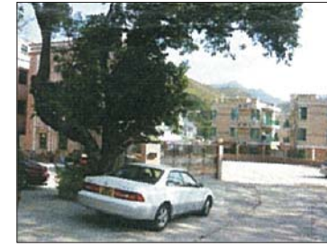
LR6.10 TRANSPORT ROUTE WITH SIGNIFICANT PLANTING