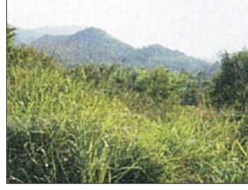
LR4.1 SHRUBBY GRASSLAND ON HILLSIDE