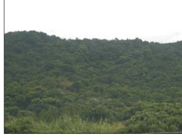
LR3.1 WOODLAND ON HILLSIDE