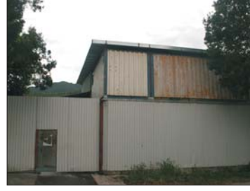
LR6.1 RURAL BUILT/OPEN STORAGE AREA