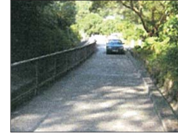
LR6.6 TRANSPORT ROUTE WITHOUT SIGNIFICANT PLANTING