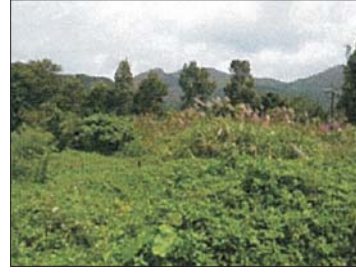
LR5.2 INACTIVE FARMLAND