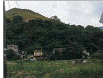
LR3.2 WOODLAND ON LOWLAND