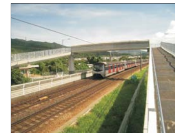
LR6.8 CEMETERY AREA