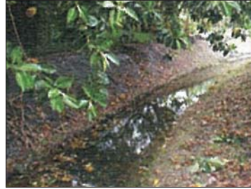
LR1.2 CHANNELIZED WATERCOURSE