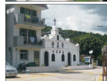
LR6.3 TRADITIONAL VILLAGE AREA