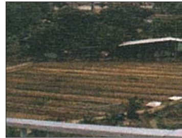
LR5.2 INACTIVE FARMLAND