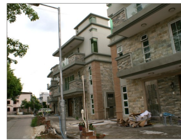
H9 Ping Yeung East