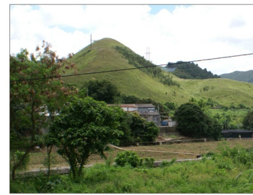
R1 Lung Mei Teng