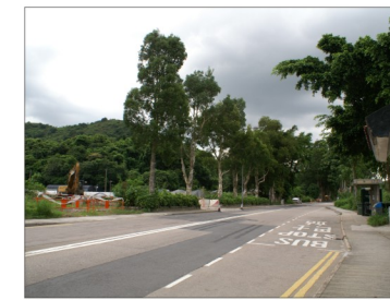
T1 Sha Tau Kok Road