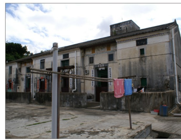
H1 Heung Yuen Wai