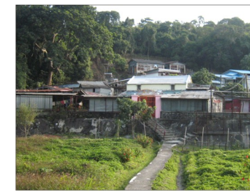
H10 Village West of Man Uk Pin