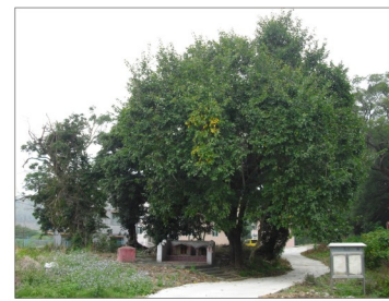
H8 Village on Wo Keng Shan Road