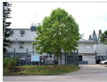
O1 Ta Kwu Ling Police Station