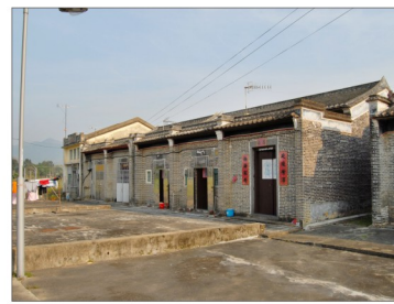
H6 Fung Wong Wu