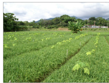
H4 Resite of Chuk Yuen Tsuen