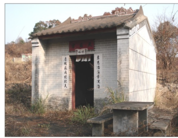
OU4 Tin Hau Temple