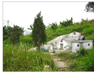
OU1 Graveyard by Poultry Farm