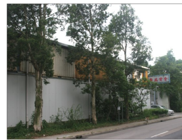
I1 Ping Yeung South Industrial Area