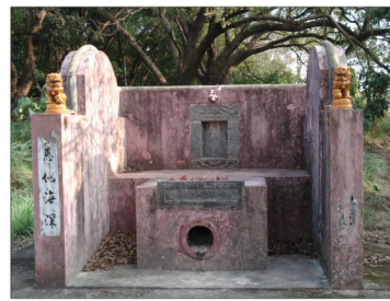
OU3 Earth Shrine near Tsung Yuen Ha