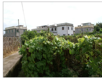
H5 Kaw Liu Tsuen