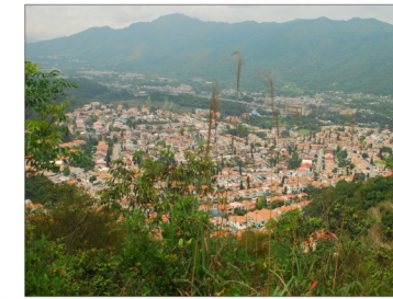
H25 Hong Lok Yuen