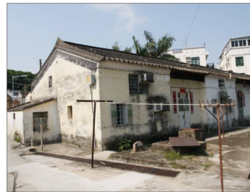
H20 Wo Hop Shek Tsuen