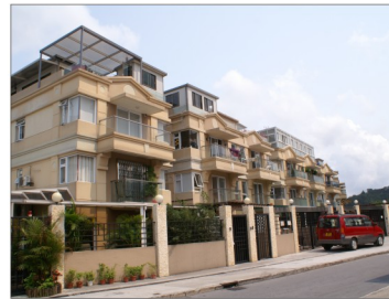
H19 Tong Hang