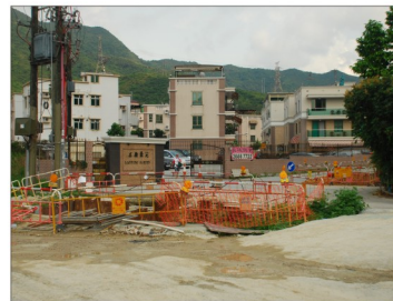
H21 Yuen Leng