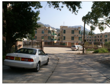
H12 Tai Tong Wu