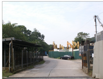
I2 Open Storage on Lau Shui Heung Road