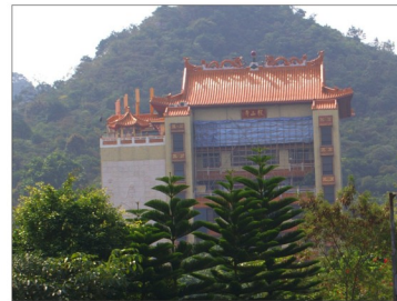
OU5 Lung Shan Temple