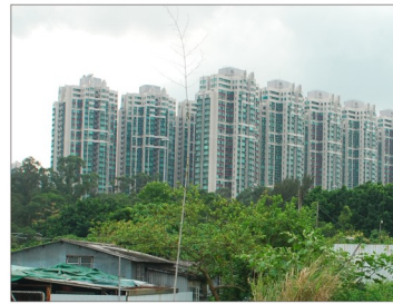
H18 Dawning Views Yuen Ha