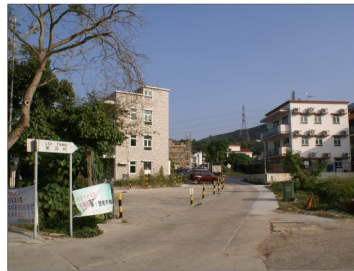
H13 Loi Tung Tsuen