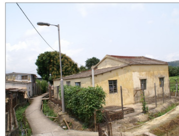
H17 Wing Ning Wai