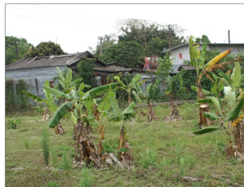
H14 Tung Kok Wai