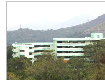
OU6 Columbarium in Wo Hop Shek Cemetery