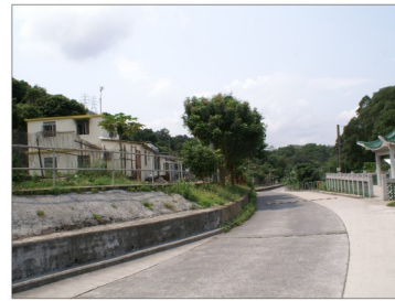
H15 Po Kat Tsai