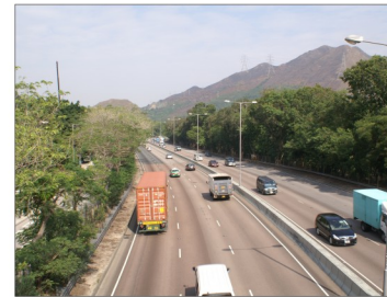
T2 Fanling Highway