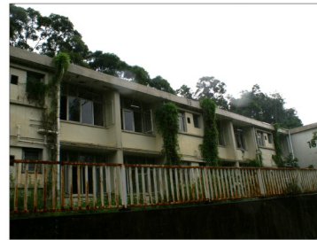
H16 Proposed CDA (Ex-Burma Lines Military site)