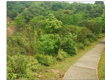
R2 Wilson Trail