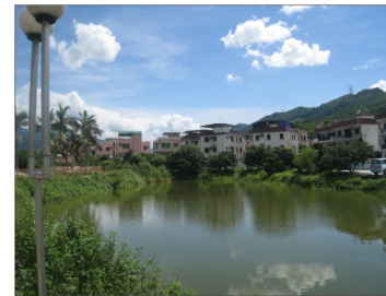
H23 Nam Wa Po