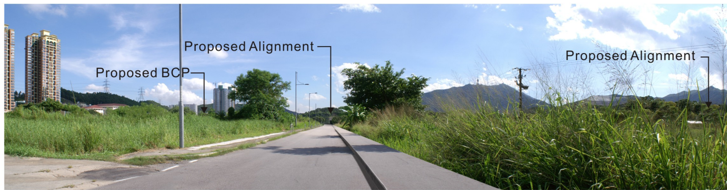
View Towards the Project with Mitigation Measures at Year 10 Operation from VP3