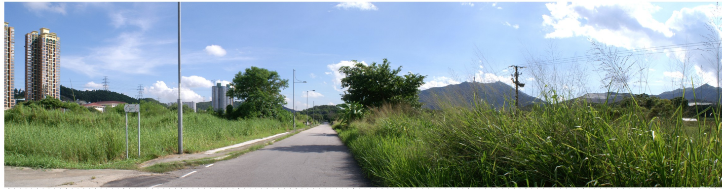
Existing View Towards the Project from VP3