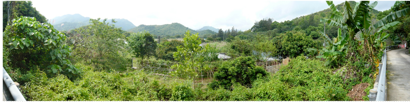
Existing View Towards the Project from VP6