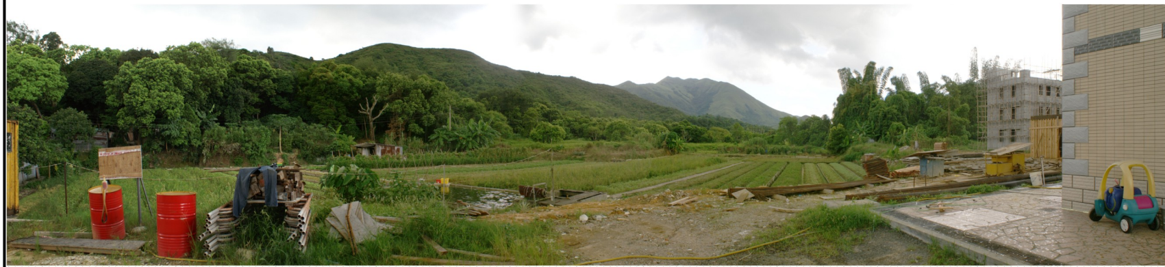
Existing View Towards the Project from VP7