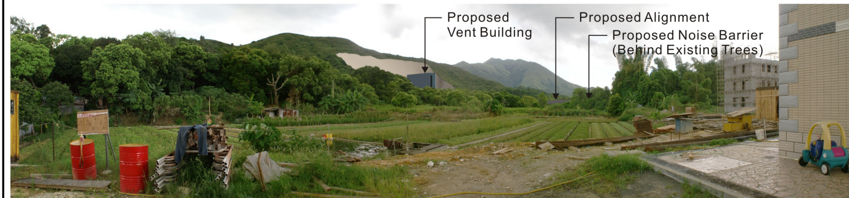
View Towards the Project without Mitigation Measures on Day 1 Operation from VP7