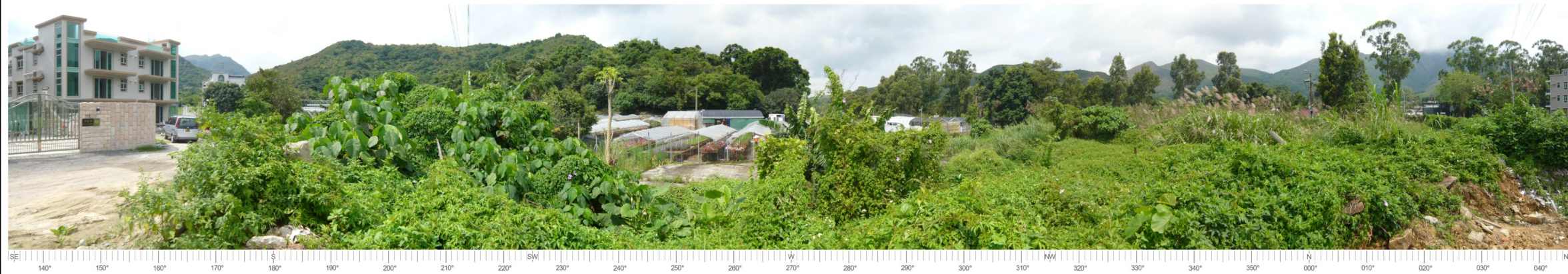
Existing View Towards the Project from VP8