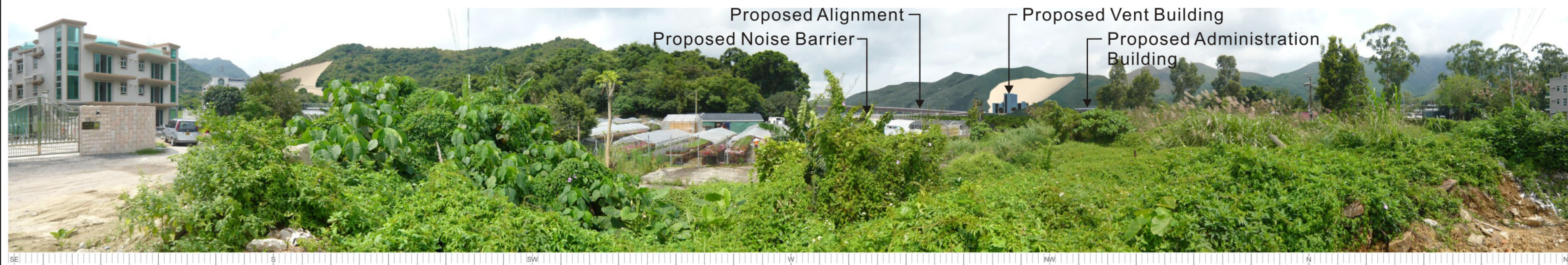
View Towards the Project without Mitigation Measures on Day 1 Operation from VP8