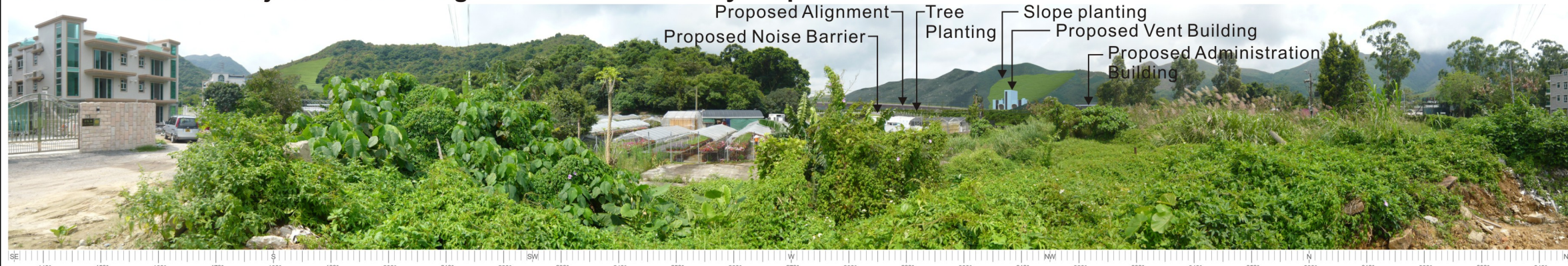
View Towards the Project with Mitigation Measures on Day 1 Operation from VP8