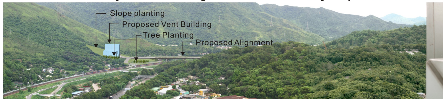
View Towards the Project with Mitigation Measures on Day 1 Operation from VP10