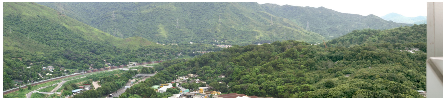
Existing View Towards the Project from VP10