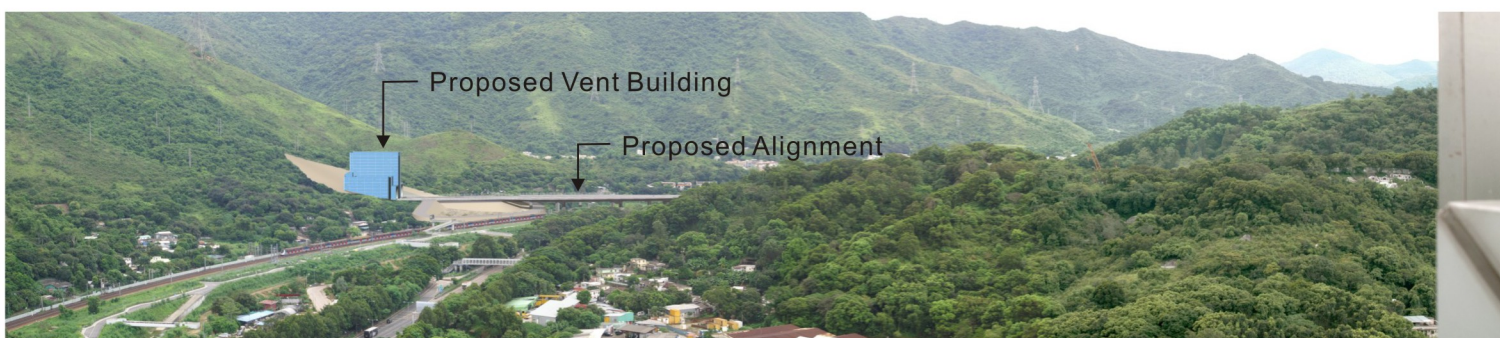
View Towards the Project without Mitigation Measures on Day 1 Operation from VP10