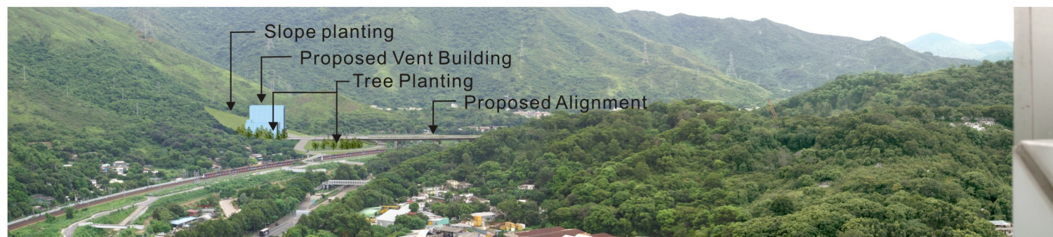
View Towards the Project with Mitigation Measures at Year 10 Operation from VP10