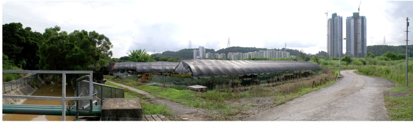
Existing View Towards the Project from VP2