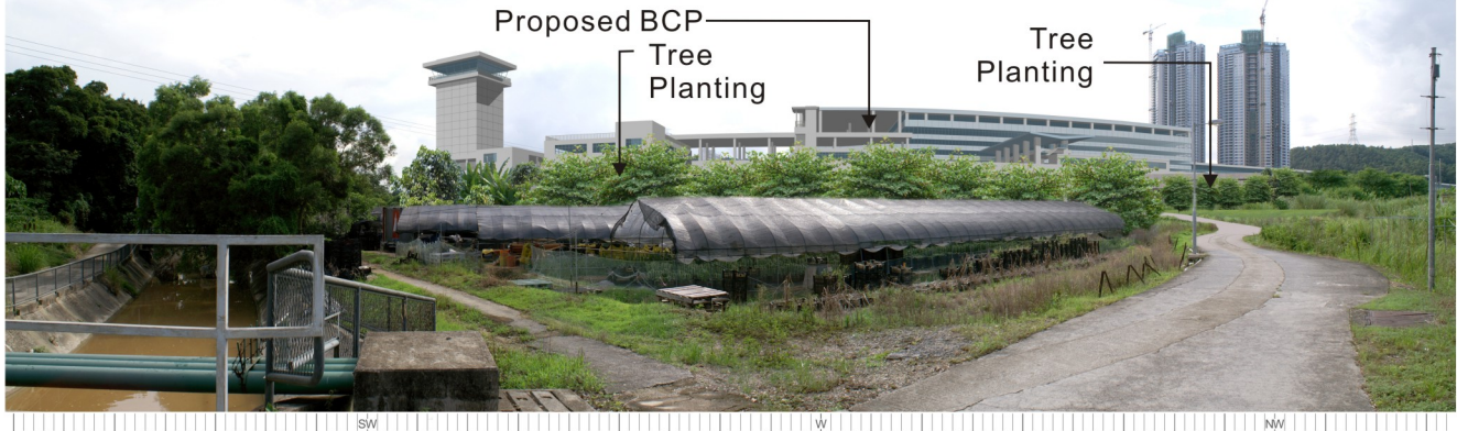
View Towards the Project with Mitigation Measures at Year 10 Operation from VP2