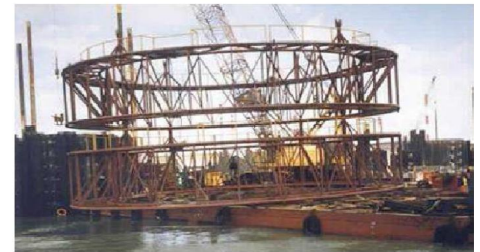
D. TEMPLATE USED TO STABILIZE CIRCULAR CELL