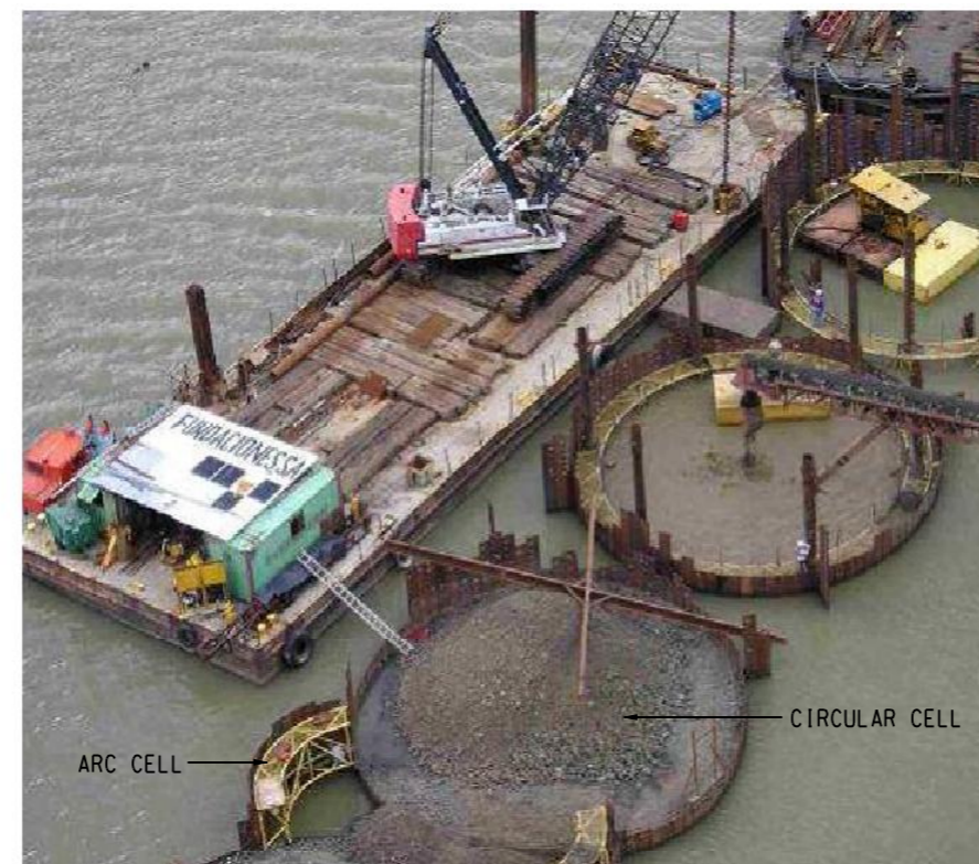
C. CONSTRUCTION OF ARC CELL CONNECTING TWO CIRCULAR CELLS