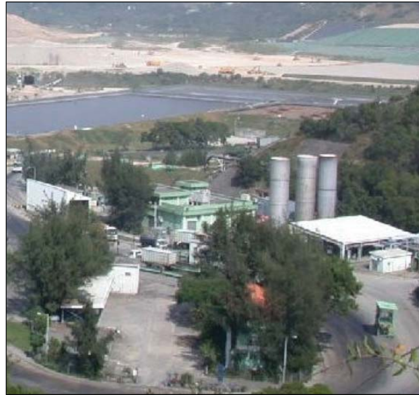
LCA2 - LANDFILL SITE