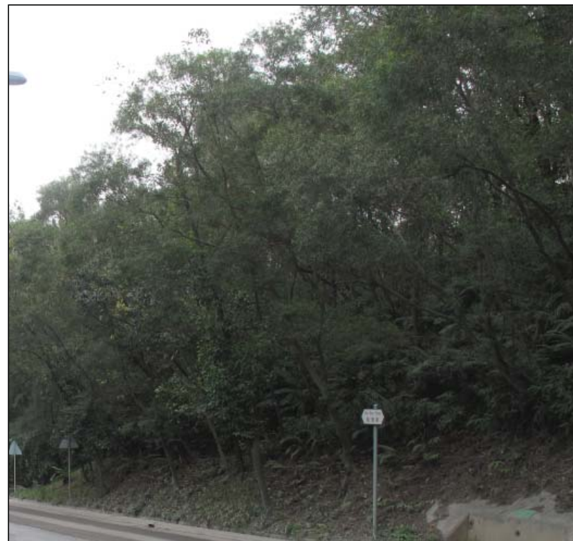
LCA4 - BARREN HILLSIDE