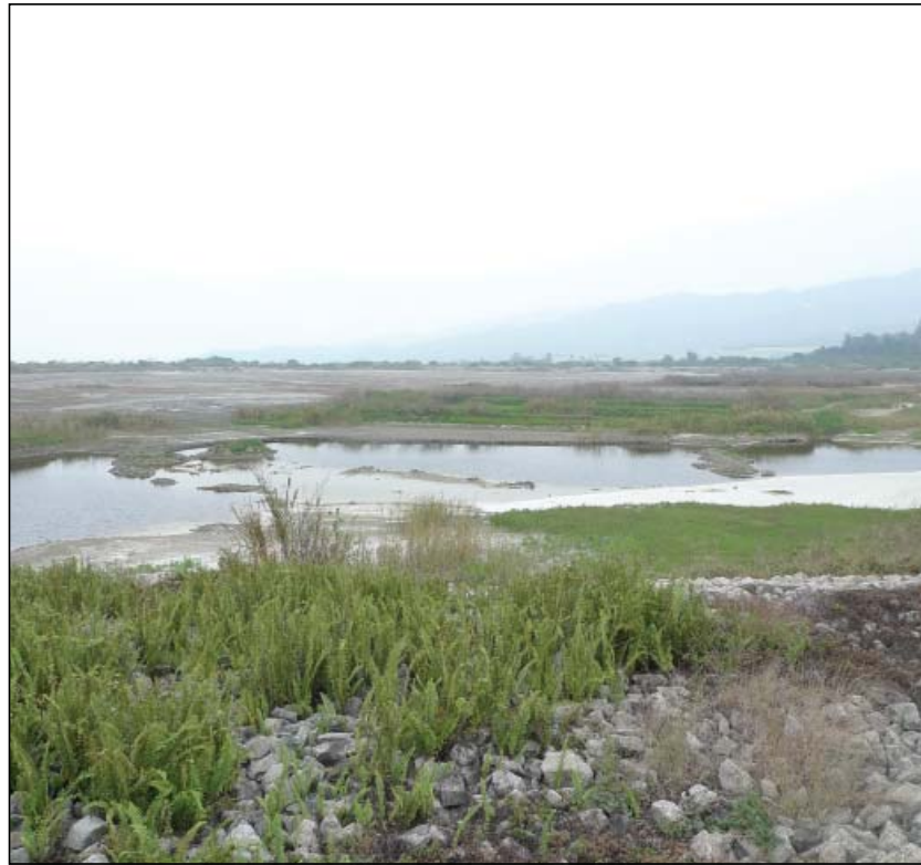
LCA1 - ASH LAGOON