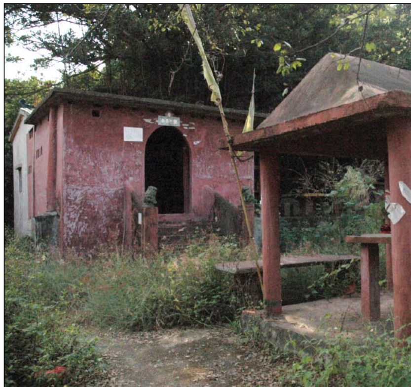
LCA3 - ABANDONED VILLAGE