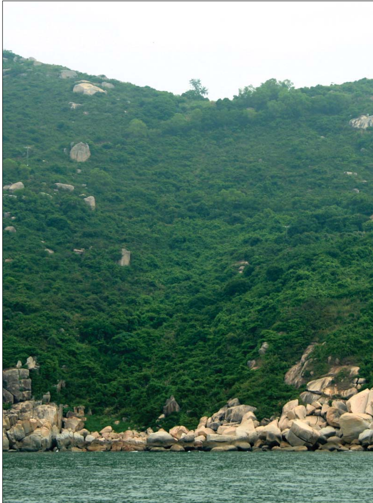
LCA1 - ISLAND LANDSCAPE