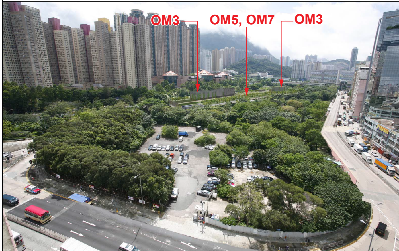
DAY 1 WITH MITIGATION