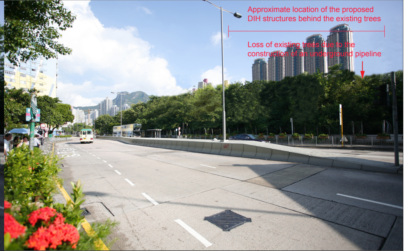
DAY 1 WITHOUT MITIGATION