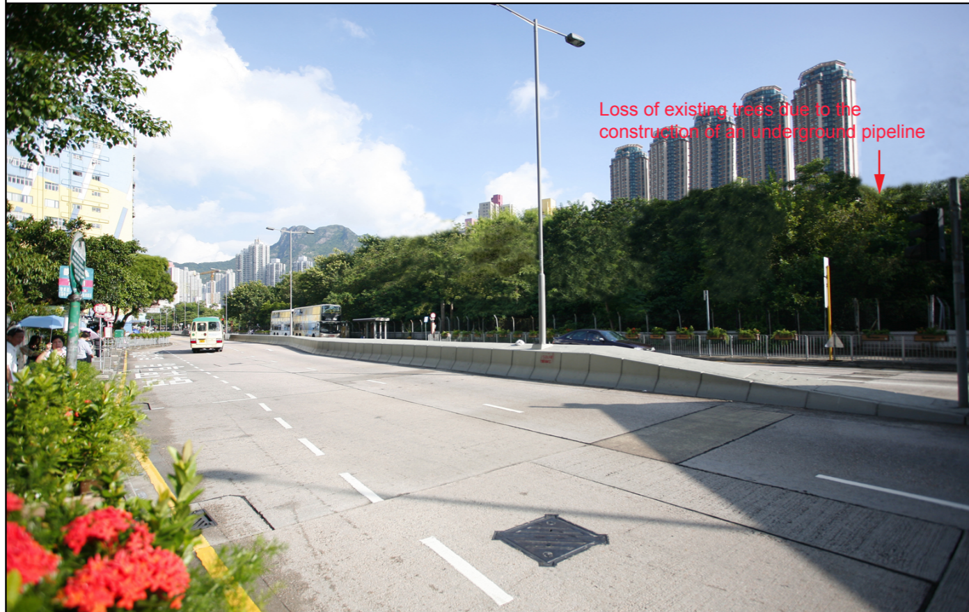
DAY 1 WITH MITIGATION