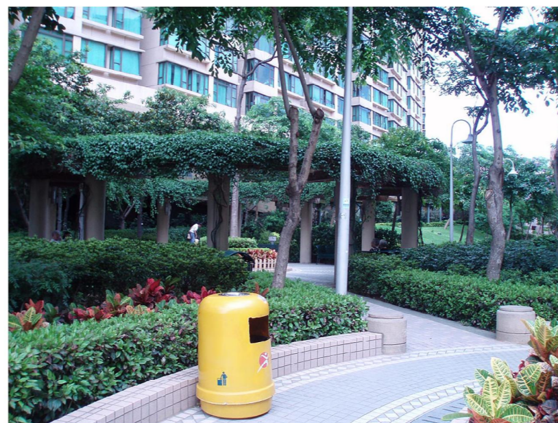
HUH/LR1.5 - HUNG HOM SOUTH ROAD REST GARDEN