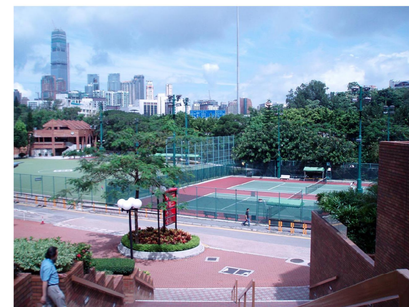
HUH/LR2.1 - Amenity Area inside Hong Kong Polytechnic University (HKPU)

PLOT DRY: R:\us\msb\mtr\p\0\DRIVER\WINDOWS\3 COL\016.dgn MODEL NAME: ME:\PROJECTS\60050763\DRAWINGS\Figure_6.4.dgn FILE NAME: 162642 2011-07-22 PRINTED BY: