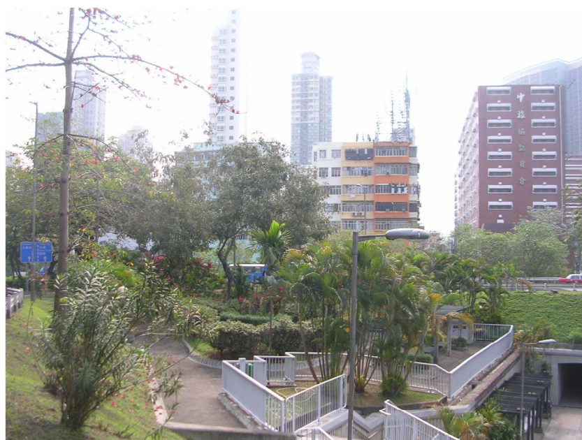
HUH/LR1.1 - PUBLIC OPEN SPACE AT CHATHAM ROAD NORTH