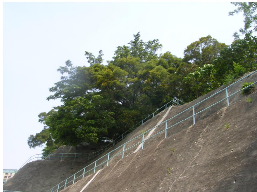
HUH/LR1.2 - TREES IN UNDEVELOPED OPEN SPACE AT CHATHAM ROAD NORTH