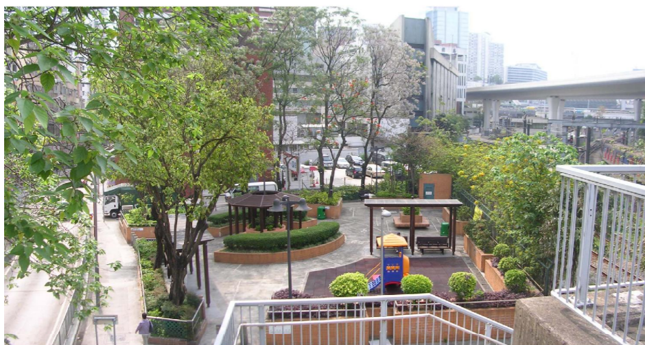
HUH/LR1.4 - WINSLOW STREET PLAYGROUND