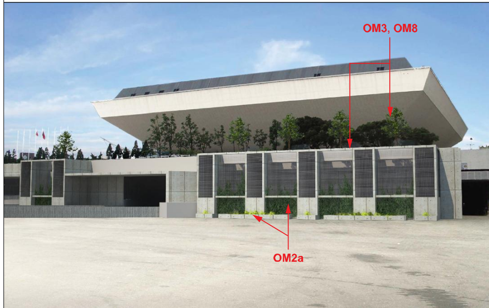
DAY 1 WITH MITIGATION