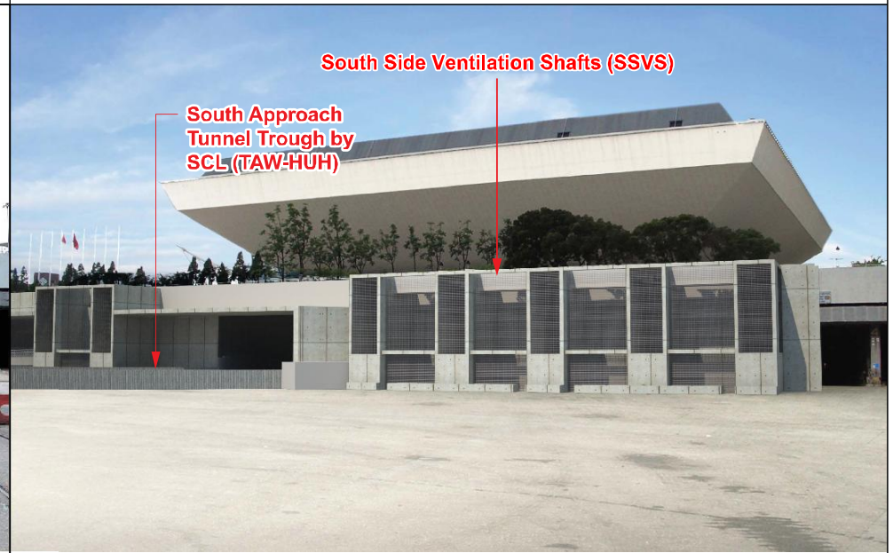
DAY 1 WITHOUT MITIGATION