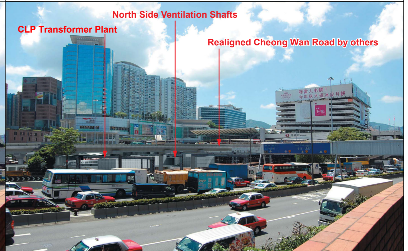
DAY 1 WITHOUT MITIGATION