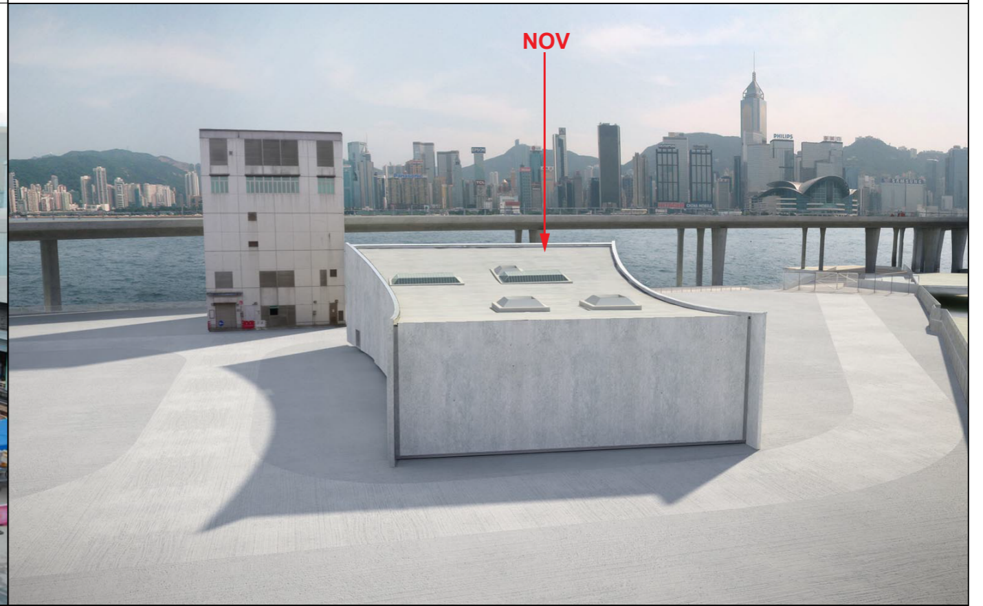
DAY 1 WITHOUT MITIGATION