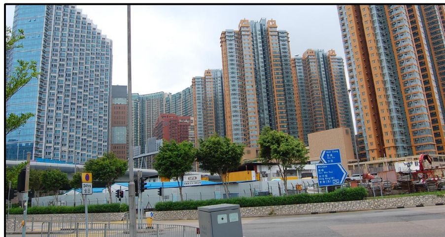
LCA 02 HUNG HOM RESIDENTIAL URBAN LCA