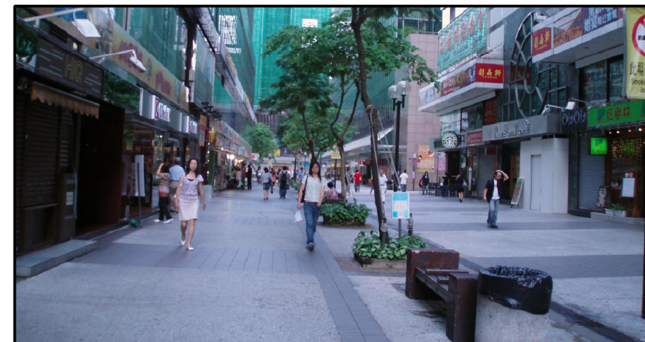
LCA 09 TSIM SHA TSUI MEDIUM/HIGH- RISE COMMERCIAL URBAN LANDSCAPE

PLOT DRW: R:\us\msh\NTR\PL\DRIVER\WINDOWS\X3\COL\016.dgn 14/07/2010 10:06 MODELNAME: M54-531A.dgn FILENAME: M54-531A.dgn PRINTED BY: ZHOUJUN DRAWING NO: NEX2213/C/361/ENS/M54-531A.dgn