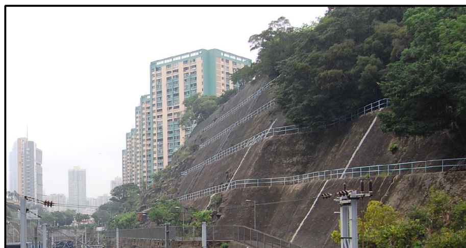
LCA 04 VALLEY ROAD MISCELLANEOUS URBAN FRINGE LCA