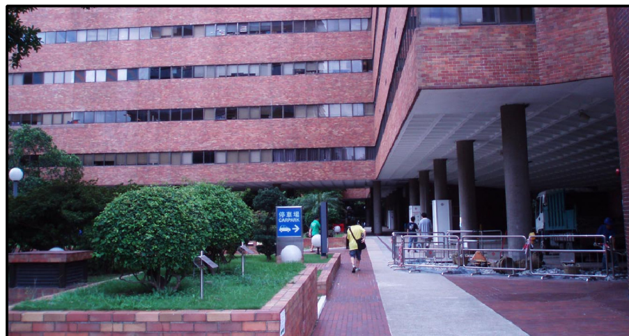
LCA 08 THE HONG KONG POLYTECHNIC UNIVERSITY (HKPU) INSTITUTIONAL LCA