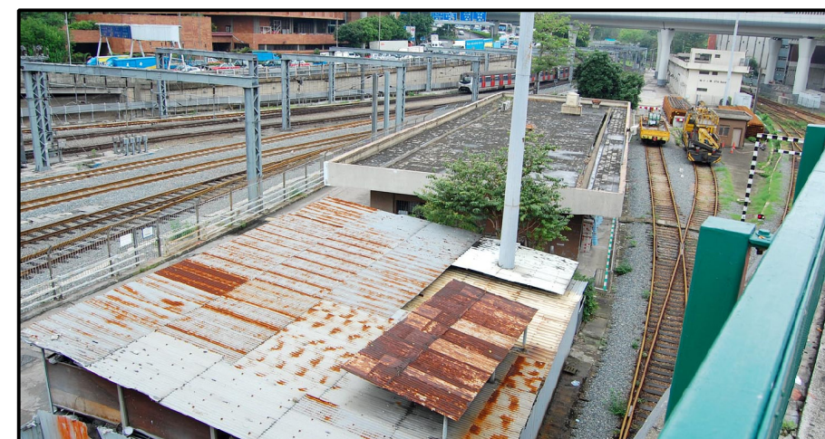
LCA 06 HUNG HOM TRANSPORTATION CORRIDOR LCA