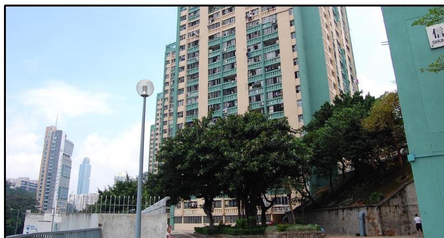
LCA 05 HO MAN TIN RESIDENTIAL URBAN LCA