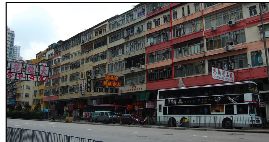
LCA 03 HUNG HOM CITY GRID MIXED URBAN LCA