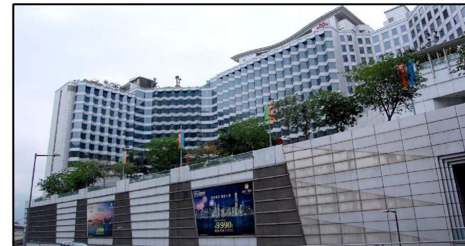
C5 HARBOUR PLAZA METROPOLIS