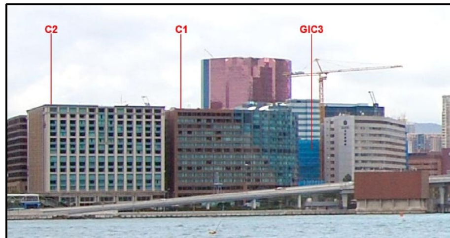
C1 & C2 & GIC3 HOTEL NIKKO HONG KONG & INTERCONTINENTAL GRAND STANFORD & HONG KONG POLYTECHNIC UNIVERSITY TEACHING HOTEL