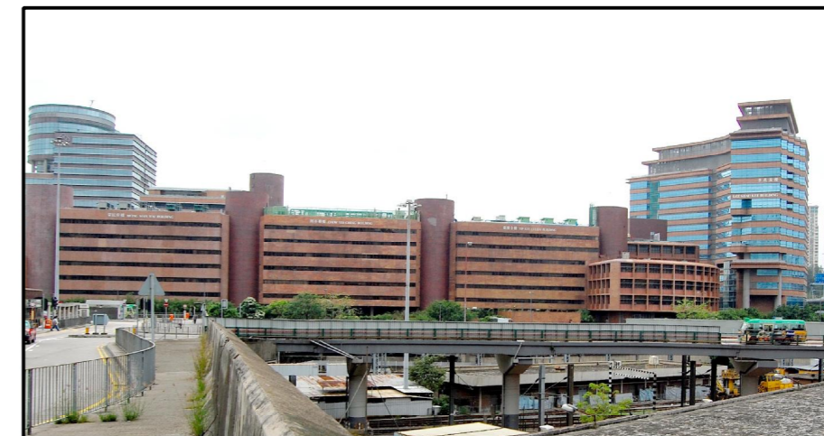
GIC2 HONG KONG POLYTECHNIC UNIVERSITY

PLOT DRY: F:\usr\mset\NTR\PI\DRIVER\WINDOWS\33 COC\016.dgn 14:30:04 MODEL NAME: 2011-8 FILE NAME: M:\projects\G0050763\DRAWINGS\000\N\NSR\NEX2213_C_361_ENS_M54_541A.dgn