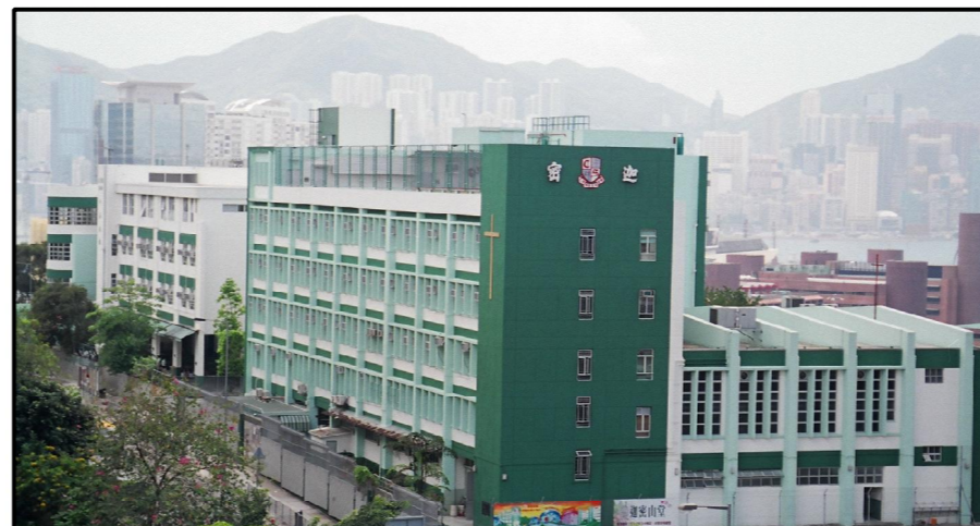
GIC1 CARMEL SECONDARY SCHOOL