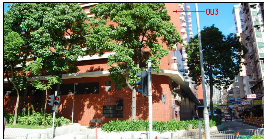
CDA1 & OU3 FUTURE DEVELOPMENT AT WINSLOW STREET & PUBLIC MORTUARY, SAI SING, INTERNATIONAL AND UNIVERSAL FUNERAL PARLOUR