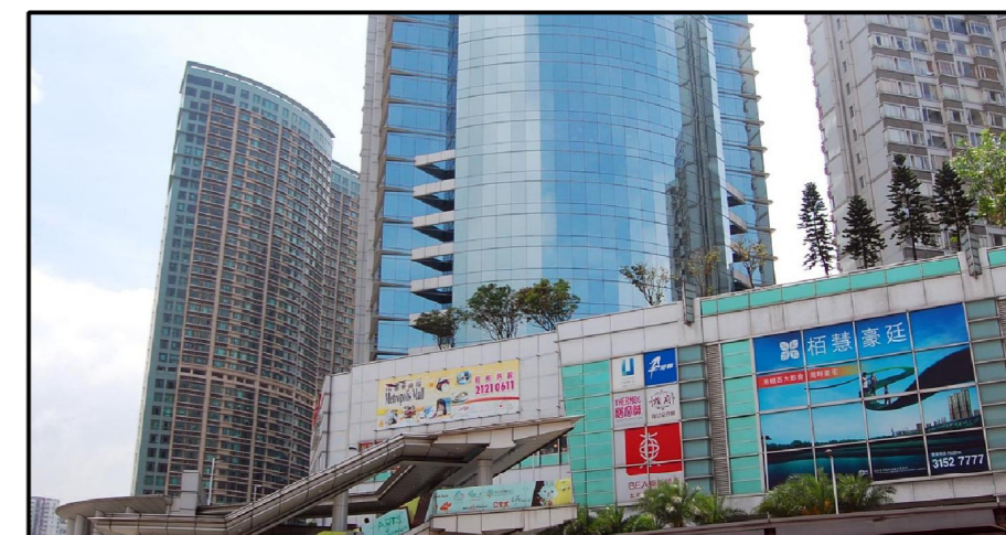
C8 THE METROPOLIS TOWER AND MALL