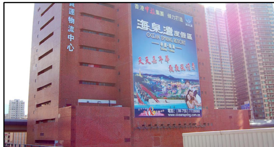
C4 CHINA TRAVEL CARGO LOGISTICS CENTRE