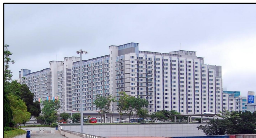
C7 HARBOURFRONT HORIZON