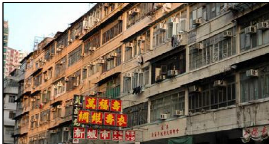
R08 MEDIUM RISE CENTRAL HUNG HOM RESIDENCE