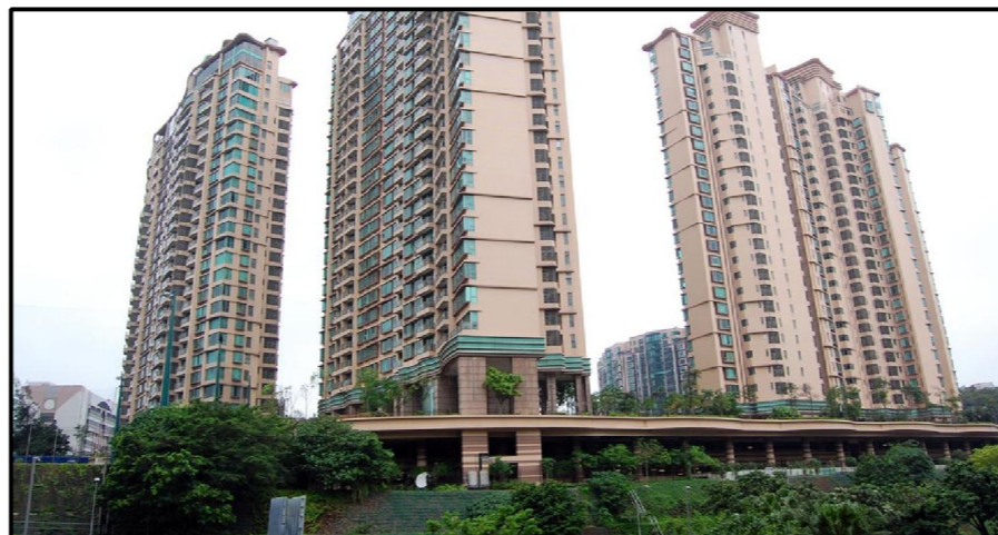
R02 PARC PALAIS