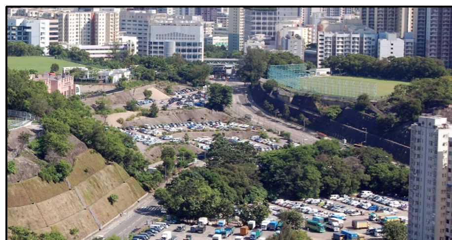
R04 PROPERTY DEVELOPMENT AT FUTURE HO MAN TIN STATION