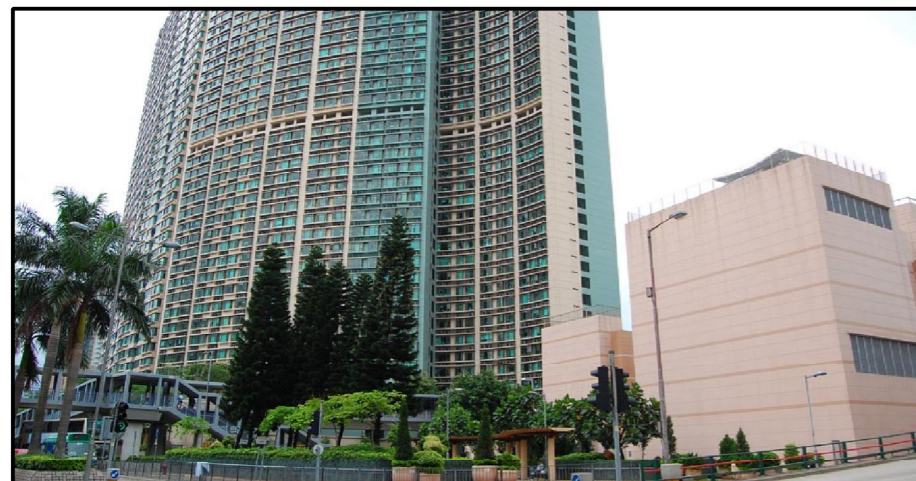
R07 ROYAL PENINSULA