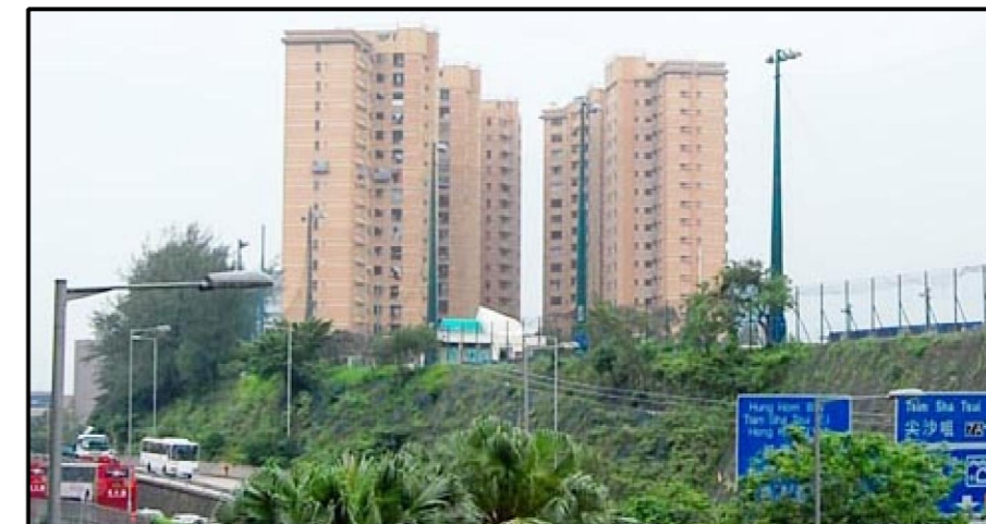
R03 WYLIE COURT