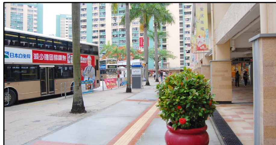
R01 OI MAN ESTATE