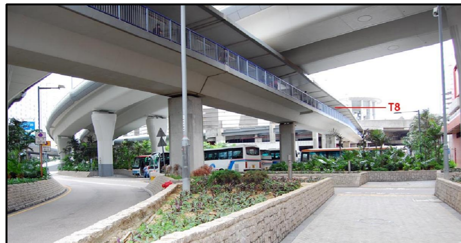
T8 FOOTBRIDGE LINKAGE TO HUNG HOM STATION

PLOT DRY: F:\usr\set\mtr\p\p\DRIVER\WINDOWS\33 COL\016.dgn MODELNAME: MTR\PROJECTS\G0050763\DRAWINGS\0000\X\ENR\NEX2213\C_361_ENR_M54_544A.dgn FILENAME: 143325 2011-8