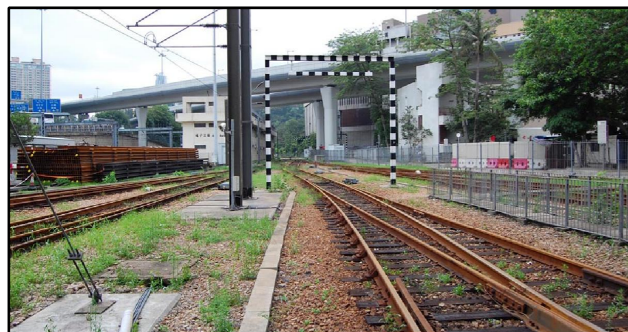
T5 TRAVELLERS ON MTR EAST RAIL LINE