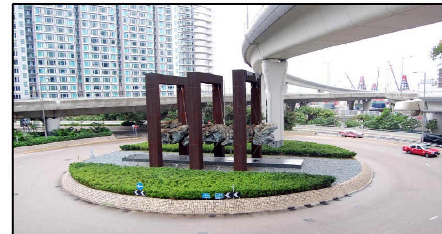
T4 TRAVELLERS ON SALISBURY FLYOVER