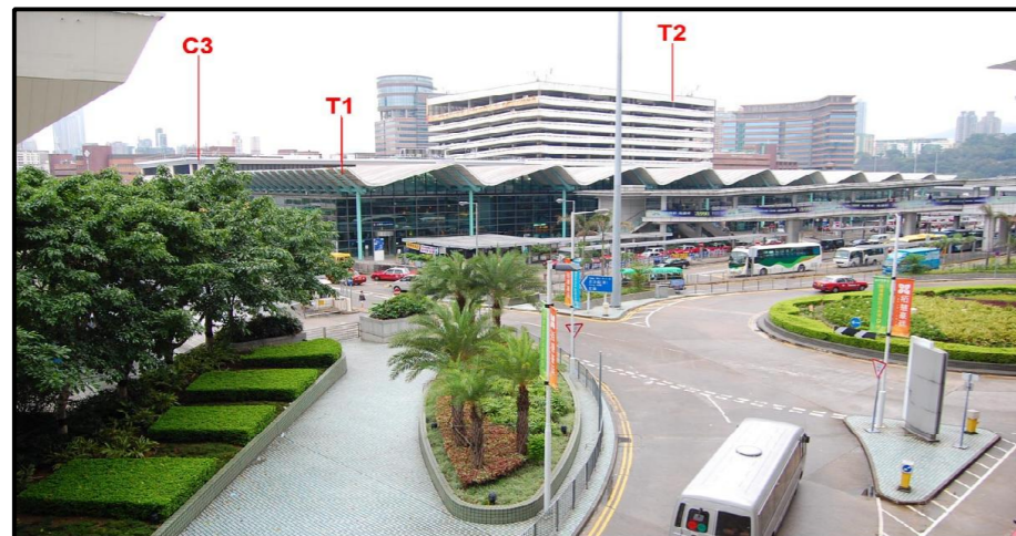
T1 & T2 & C3 HUNG HOM STATION CARPARK & MTR HUNG HOM BUILDING