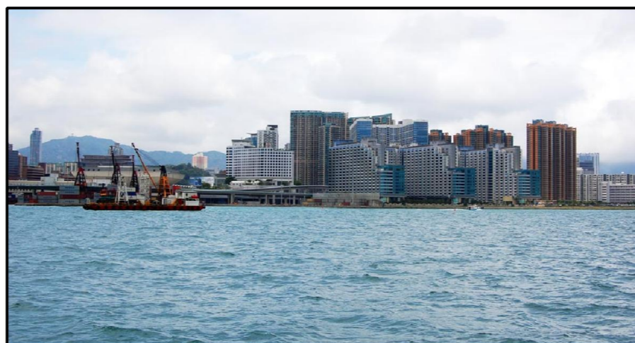
T6 TRAVELLERS IN VICTORIA HARBOUR