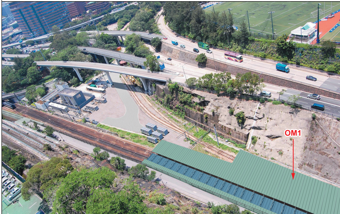
DAY 1 WITH MITIGATION