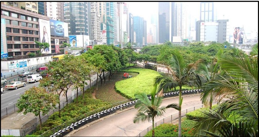
T2 WAN CHAI INTERCHANGE