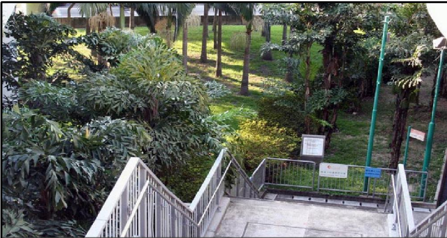
05 TUNNEL APPROACH REST GARDEN