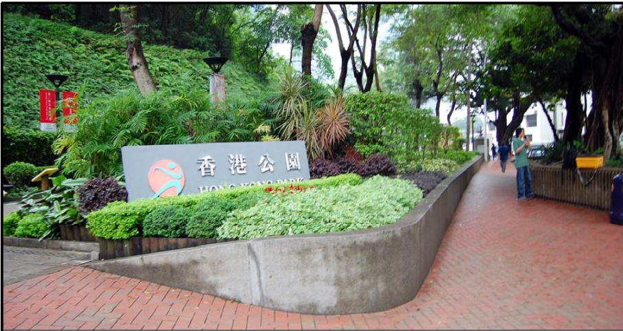
08 HONG KONG PARK