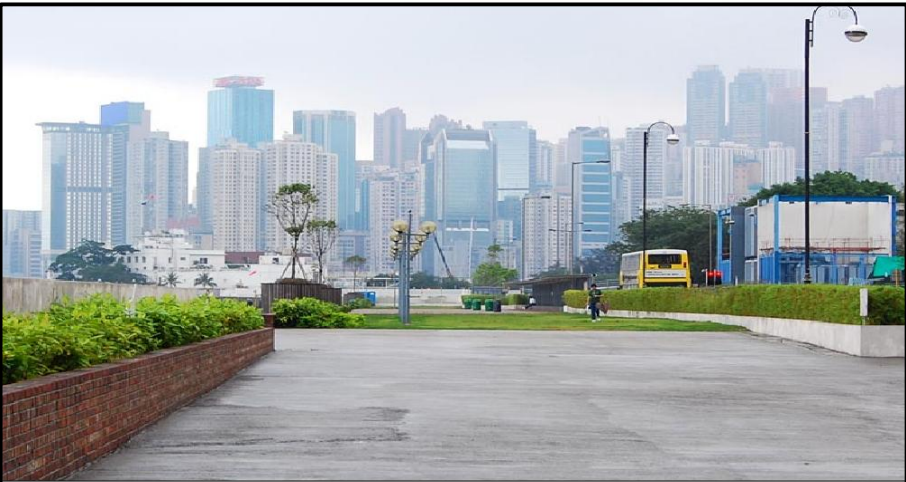
09 WAN CHAI WATERFRONT