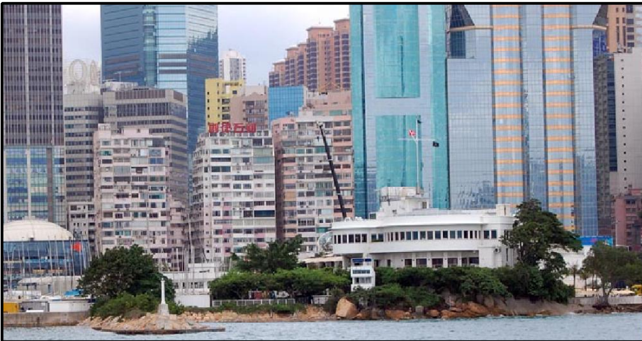
0U1 ROYAL HONG KONG YACHT CLUB