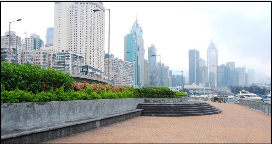
010 CAUSEWAY BAY WATERFRONT