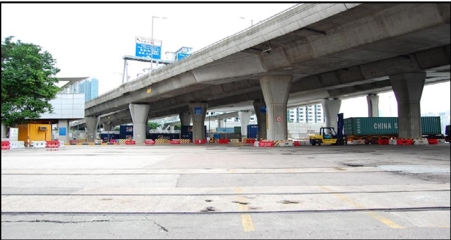
0U3 FREIGHT TERMINAL