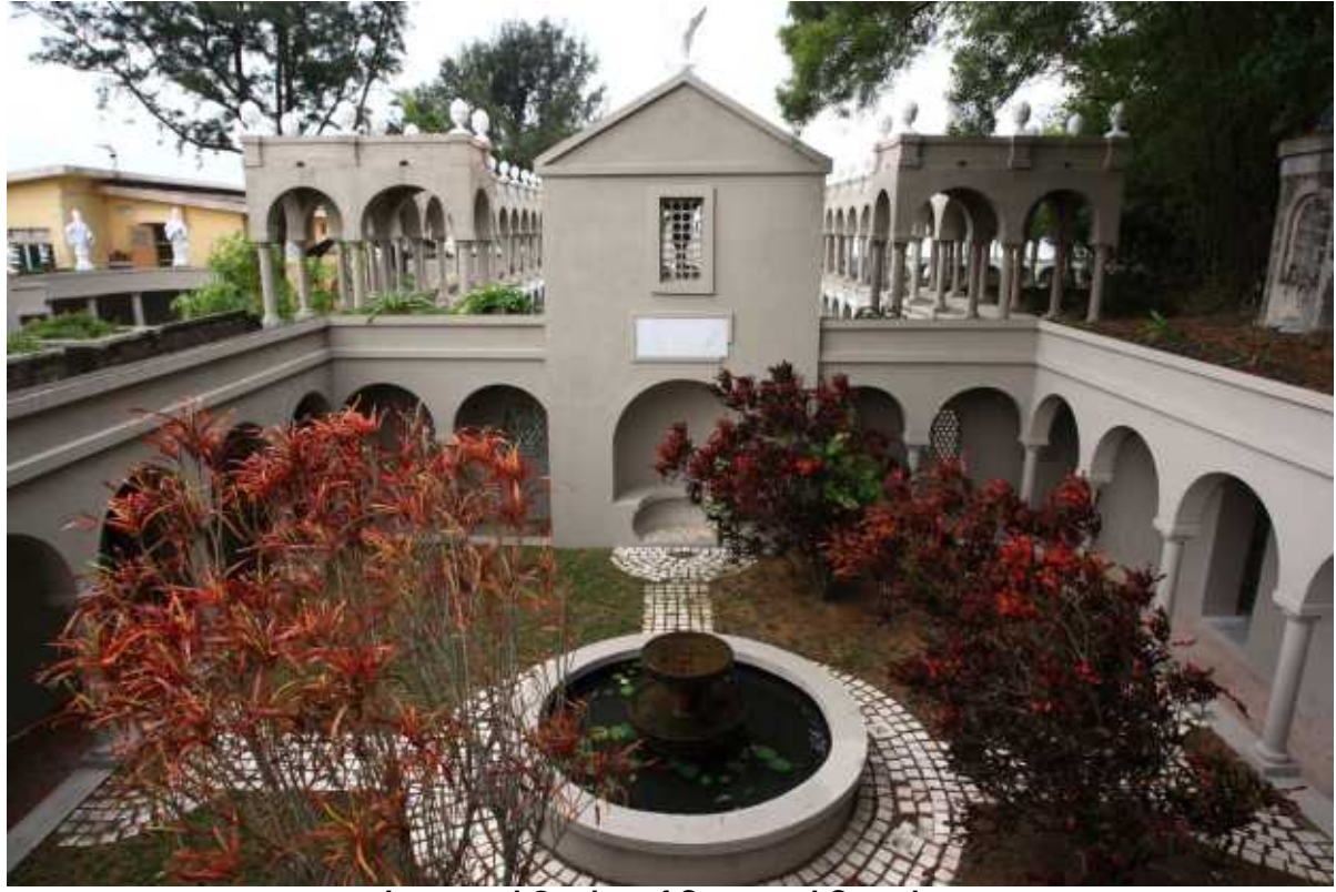
Lawn and Garden of Courtyard Complex