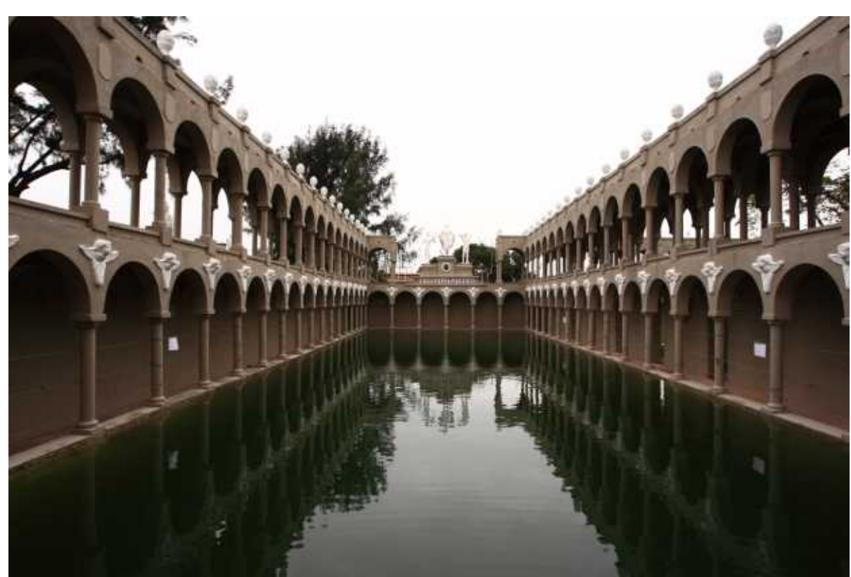
The Courtyard, used as a Water Storage Facility