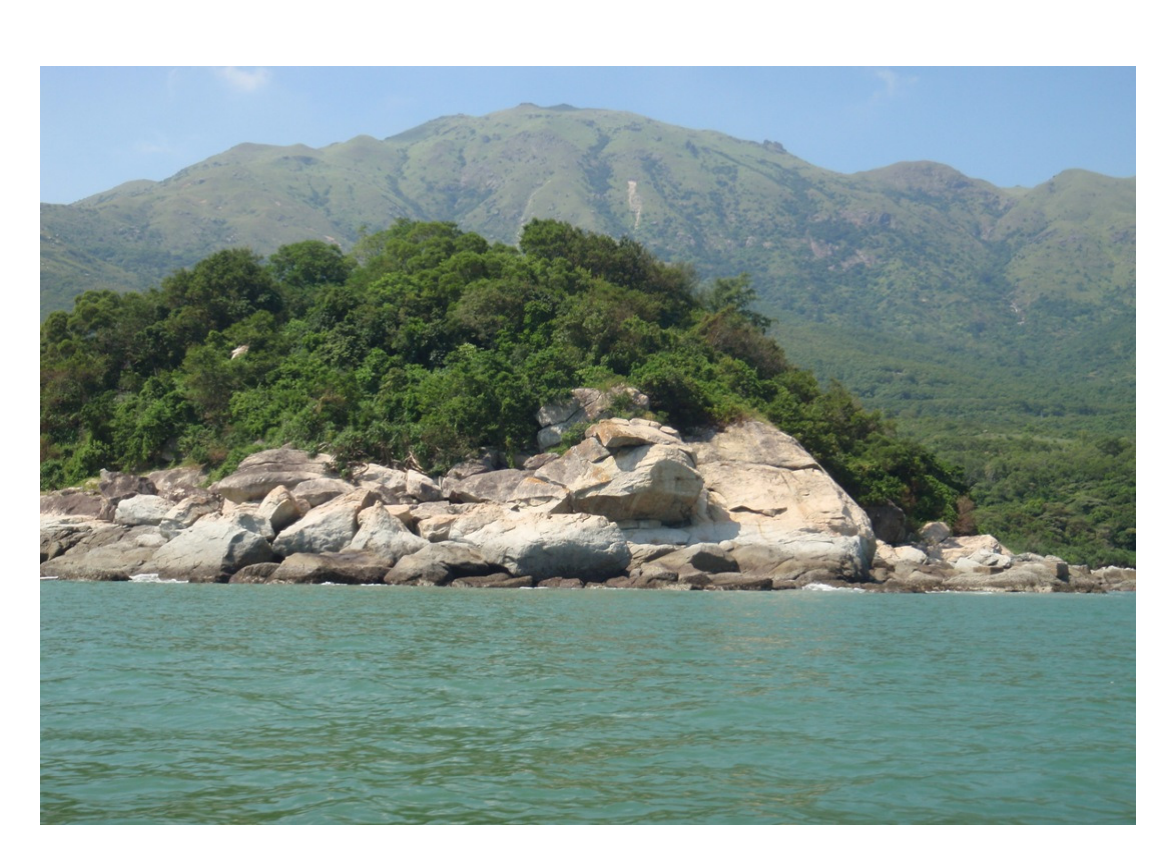
Rocky Shore and Backshore