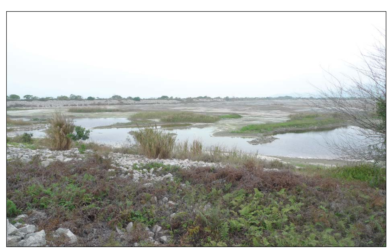
LR1 - ASH LAGOON & TREES