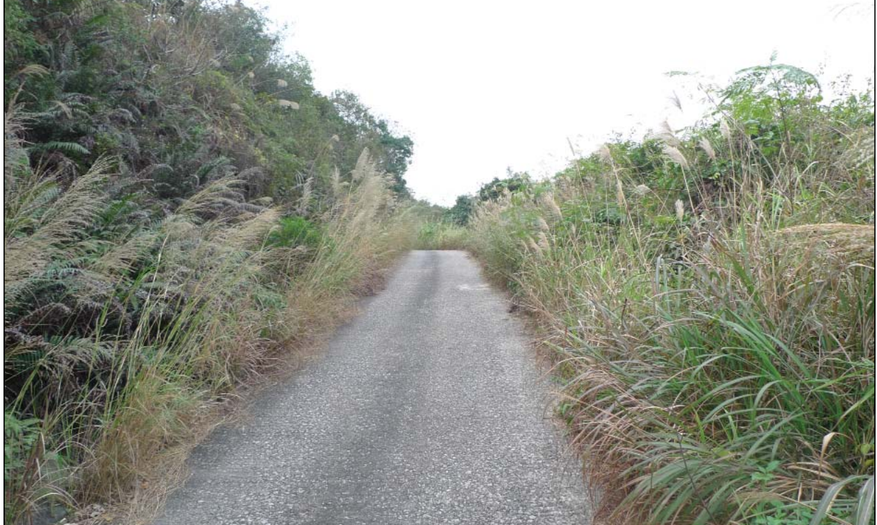
LR4 - WOODLAND & SHRUBLAND